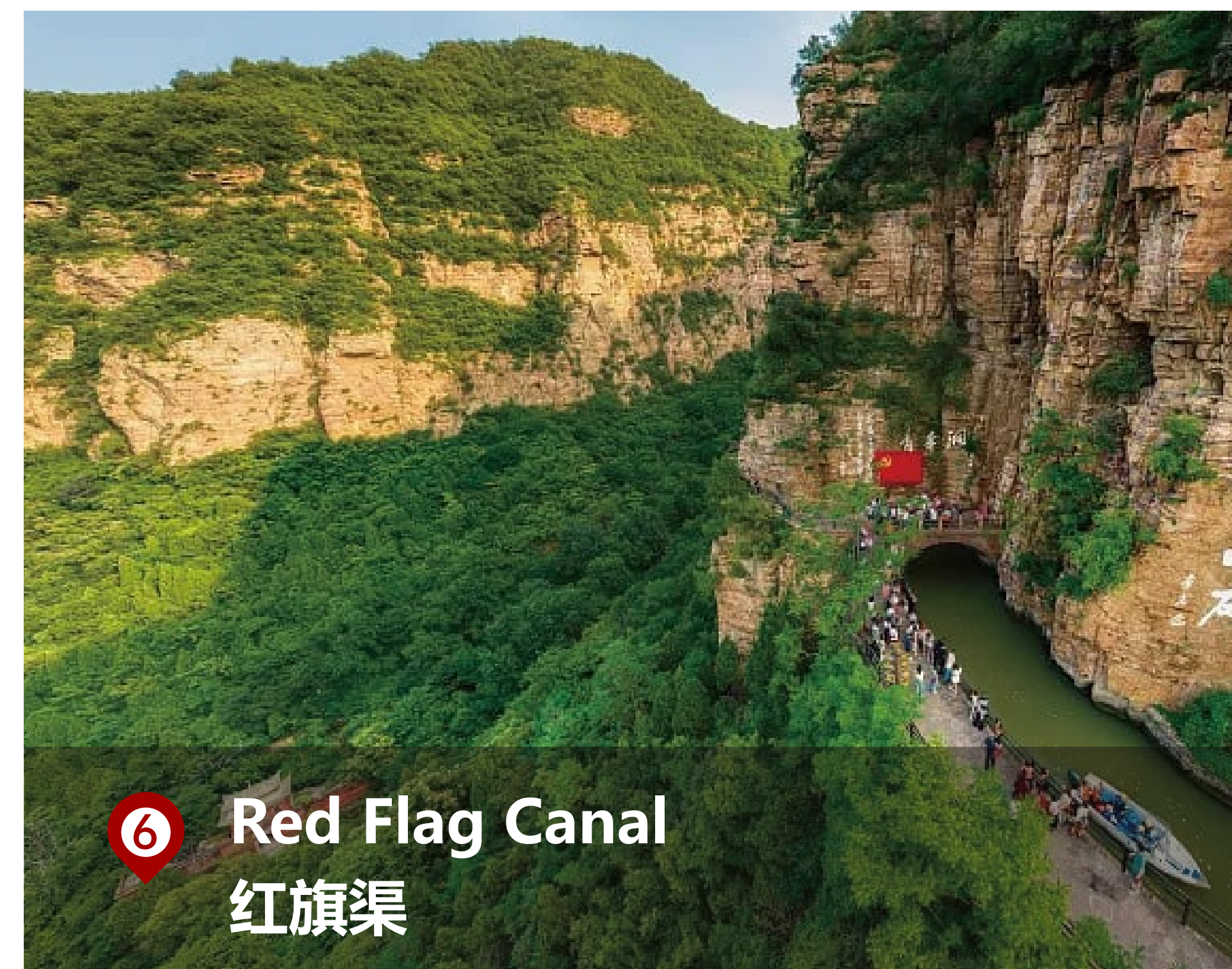
⑥ Red Flag Canal 红旗渠