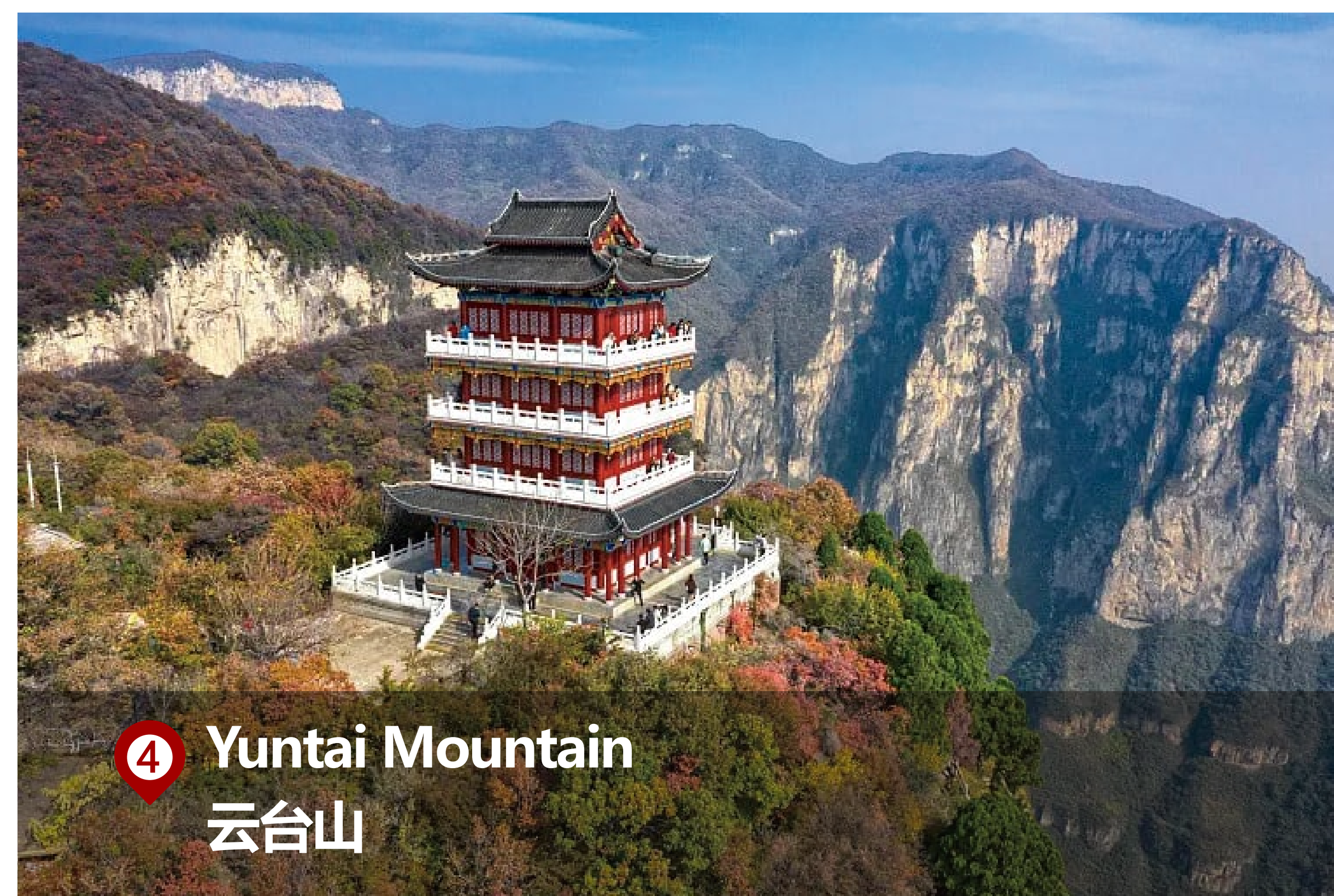
④ Yuntai Mountain 云台山