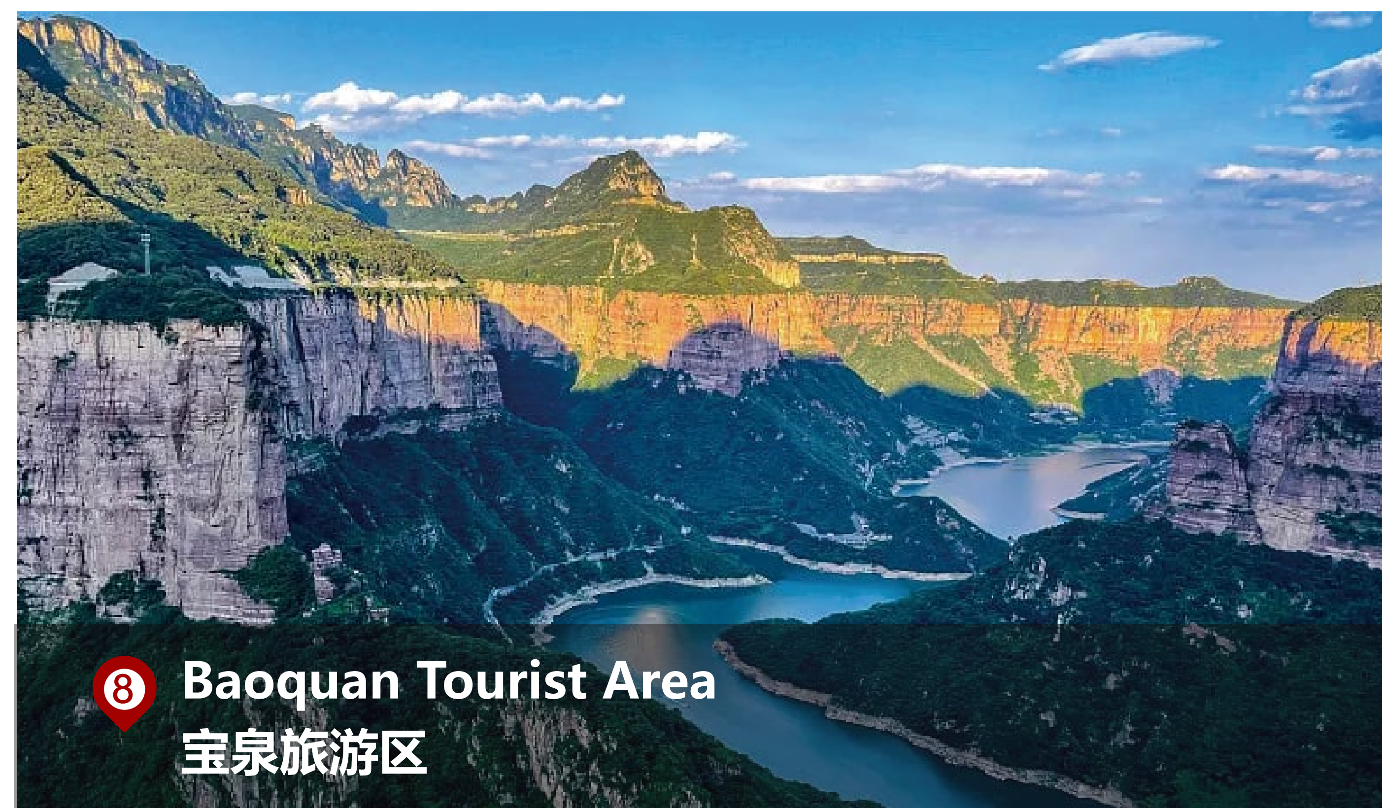
⑧ Baoquan Tourist Area 宝泉旅游区