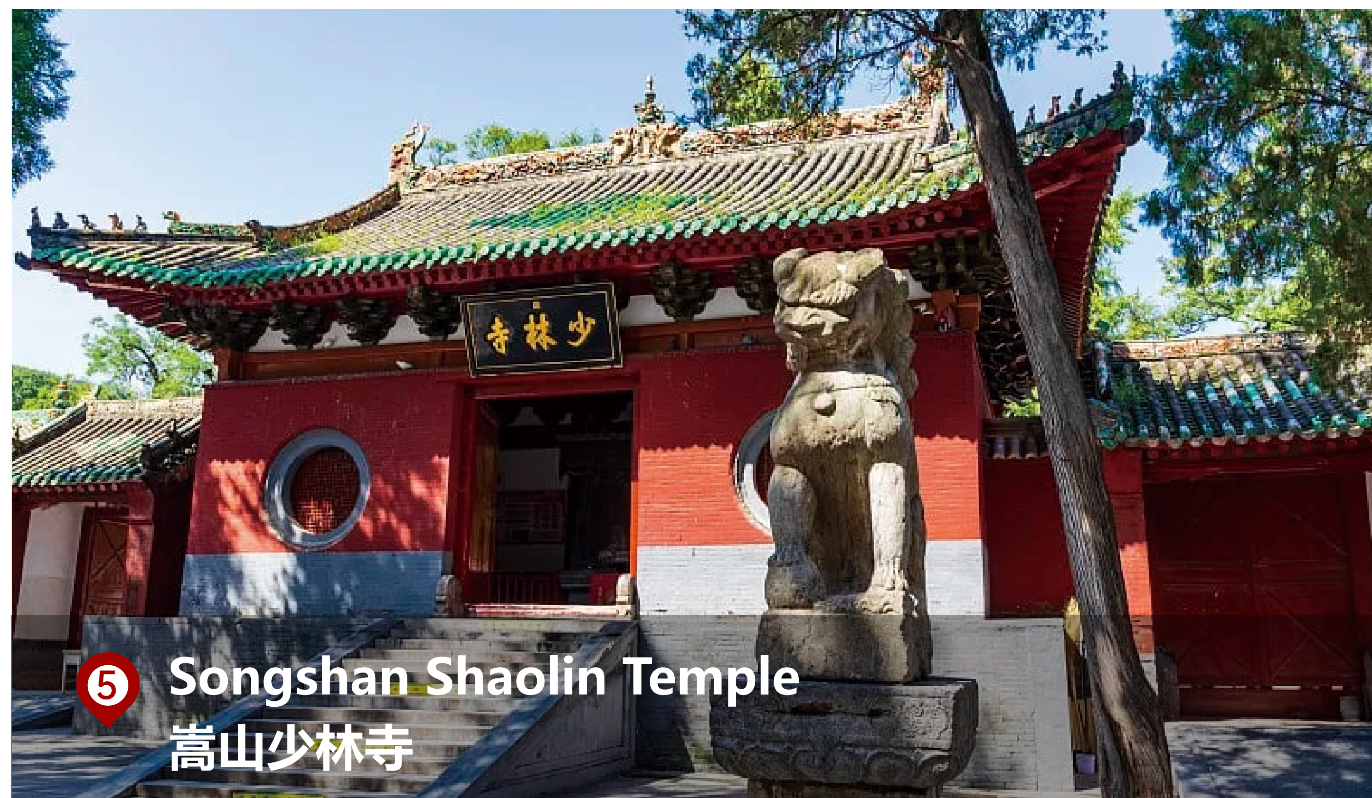
⑤ Songshan Shaolin Temple 嵩山少林寺