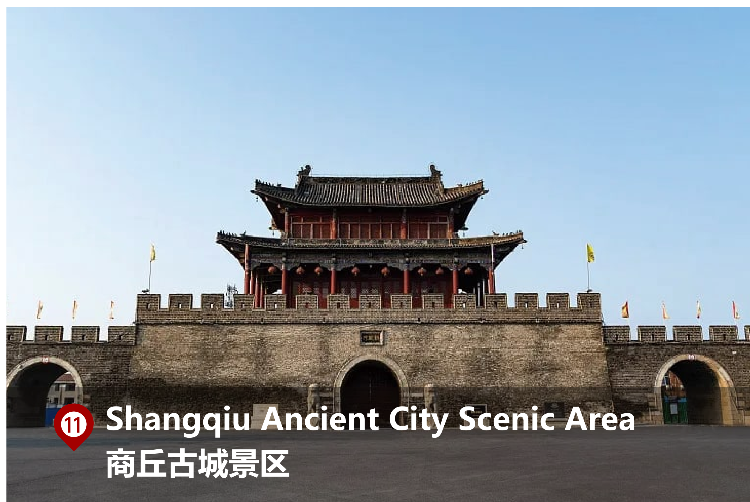
⑪ Shangqiu Ancient City Scenic Area 商丘古城景区