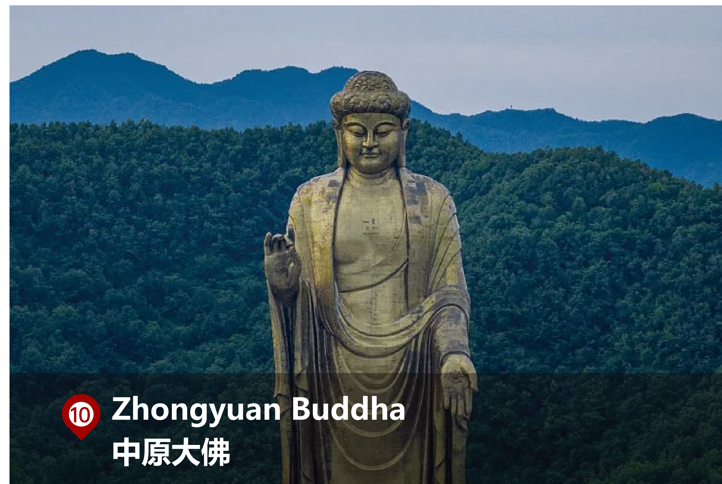
⑩ Zhongyuan Buddha 中原大佛