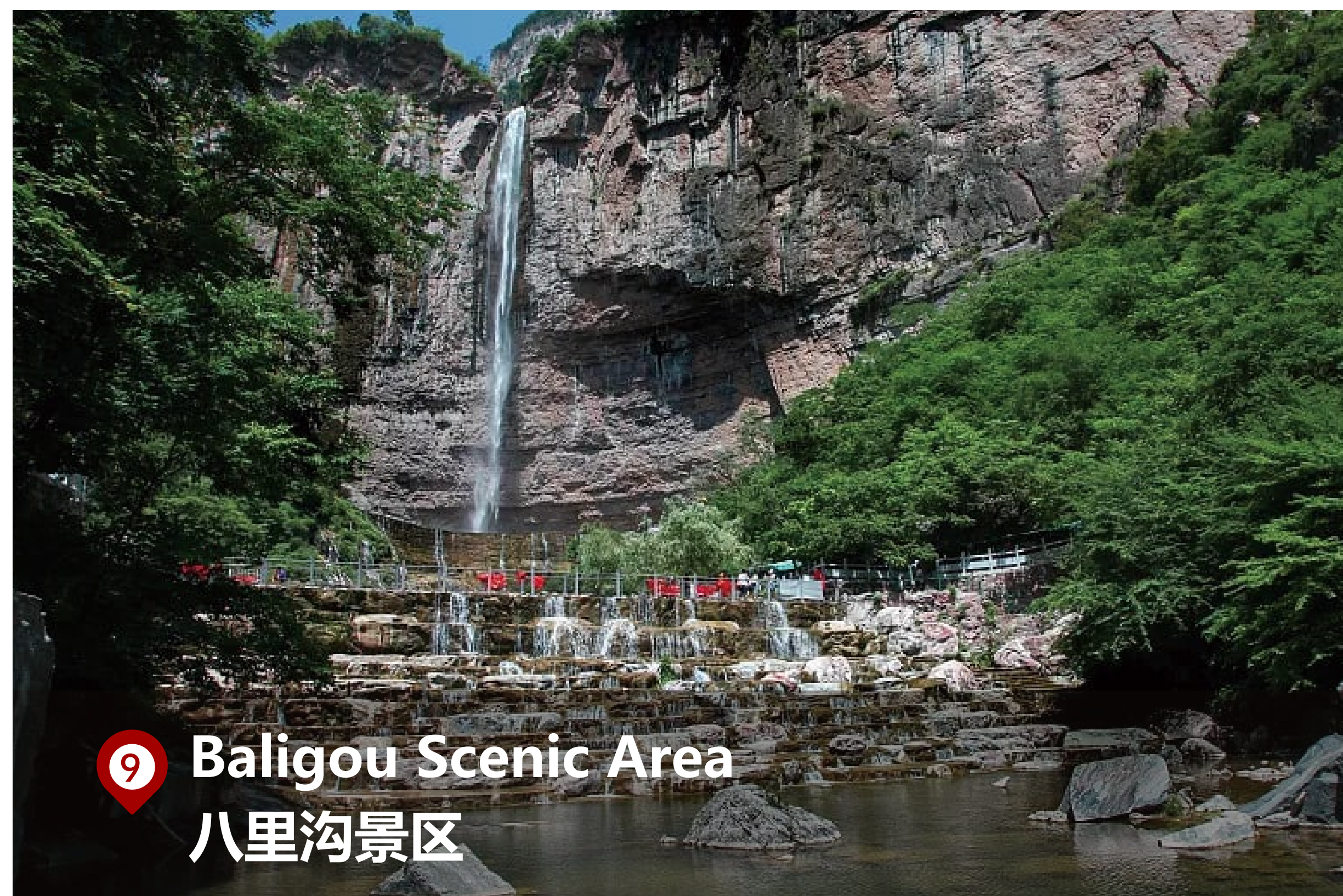
⑨ Baligou Scenic Area 八里沟景区