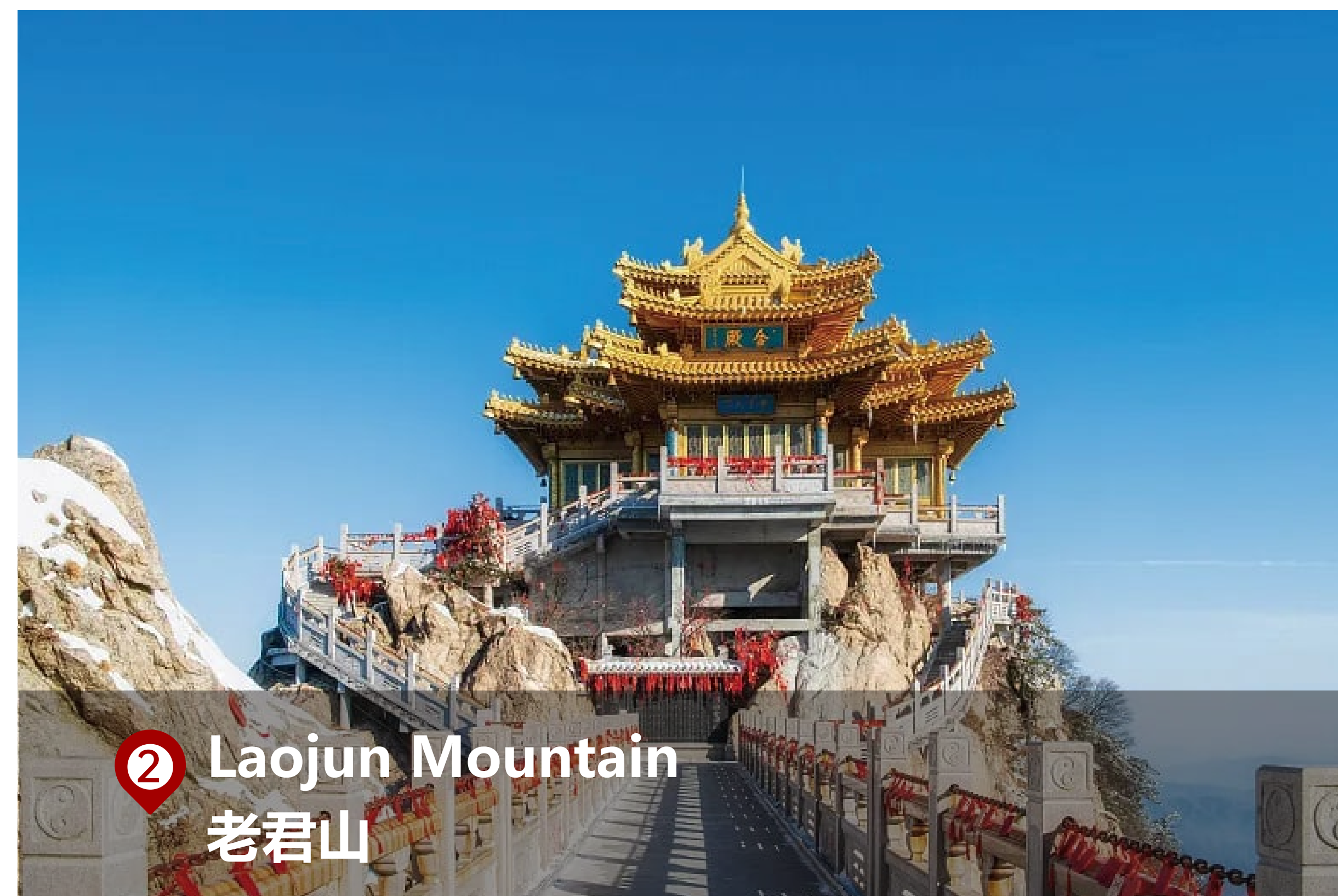
② Laojun Mountain 老君山