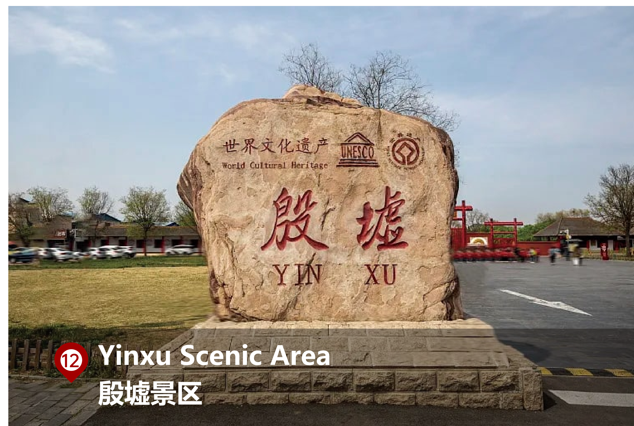
⑫ Yinxu Scenic Area 殷墟景区