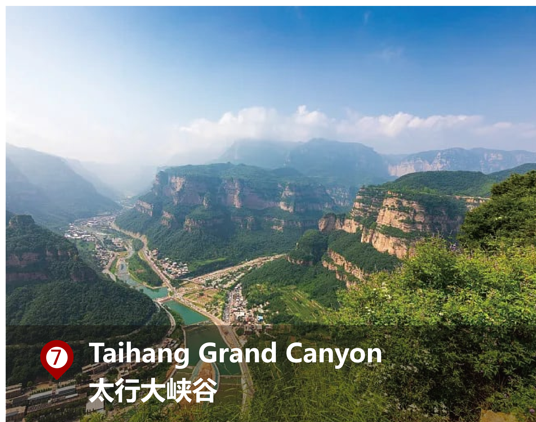
⑦ Taihang Grand Canyon 太行大峡谷