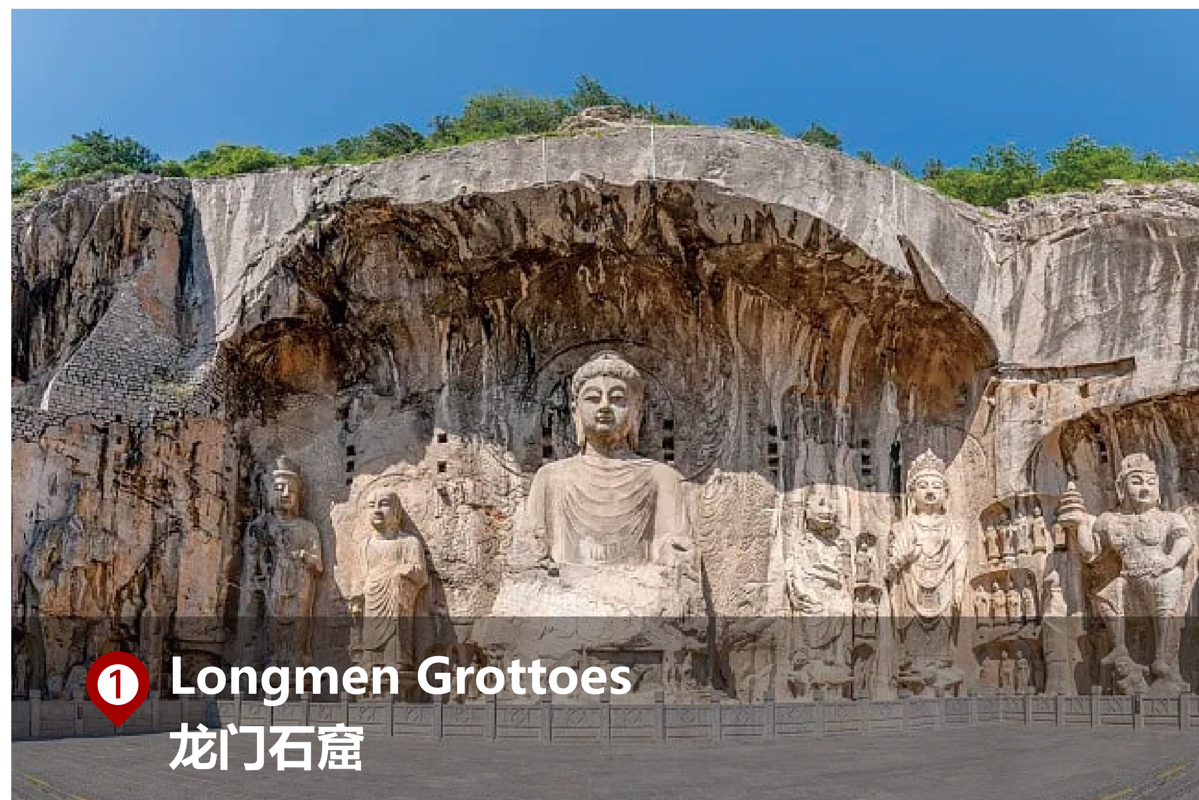
① Longmen Grottoes 龙门石窟