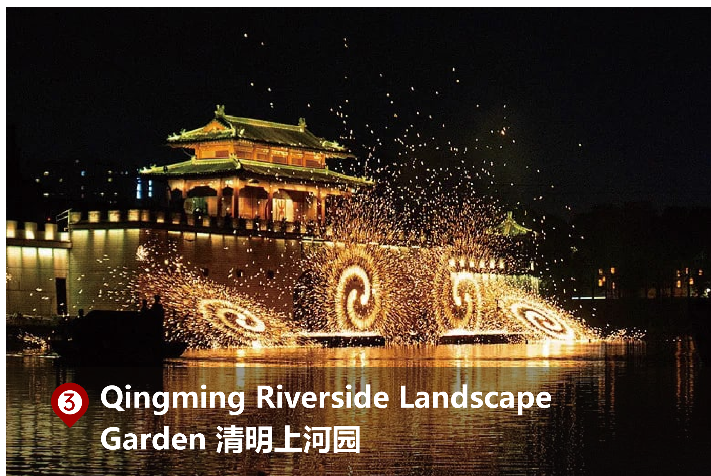
③ Qingming Riverside Landscape Garden 清明上河园