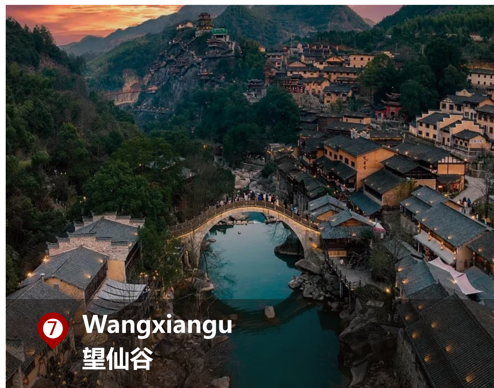
⑦ Wangxiangu 望仙谷