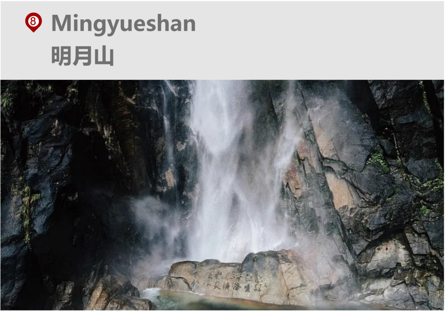
8 Mingyueshan 明月山

Mingyue Mountain is divided into the Tanxia area and the four peak areas, boasting fantastic natural scenery and Buddhist and Taoist religious architecture. The mountain features five waterfalls, with the Yungu Waterfall, the largest waterfall in southern China, being particularly famous. The rare alpine meadows and stunning sunrises of Taiping Mountain are the core attractions.