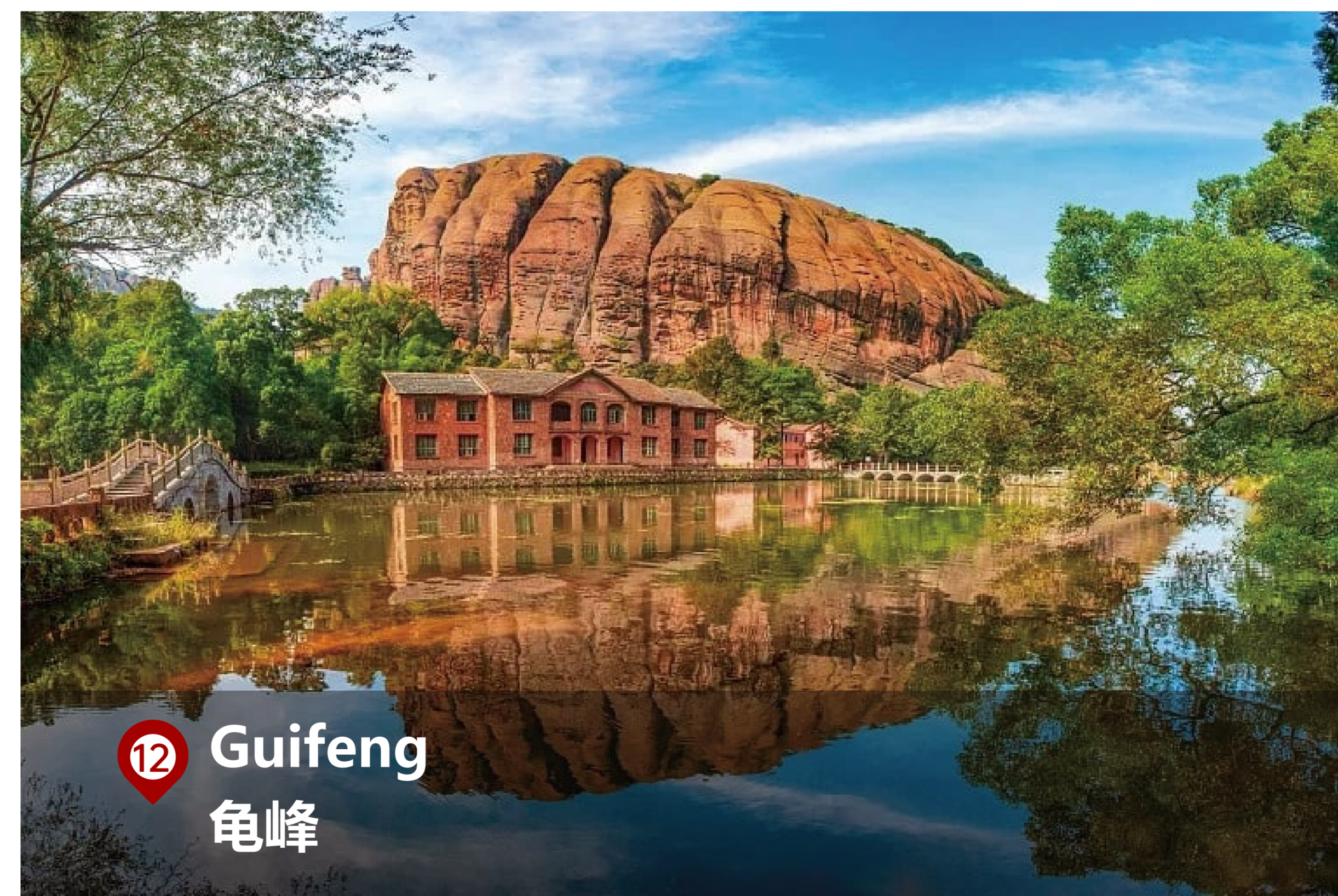
⑫ Guifeng 龟峰