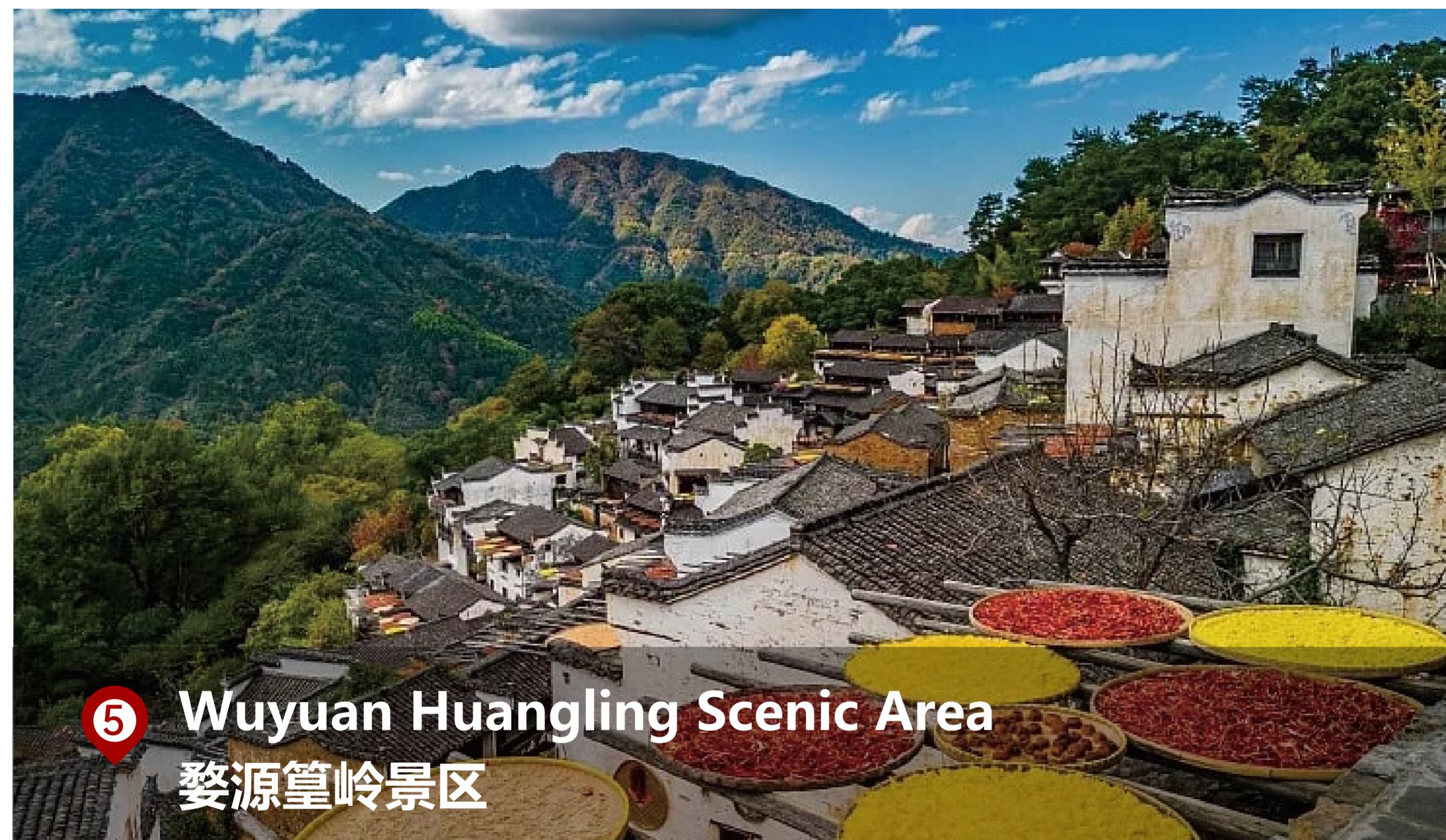
⑤ Wuyuan Huangling Scenic Area 婺源篁岭景区