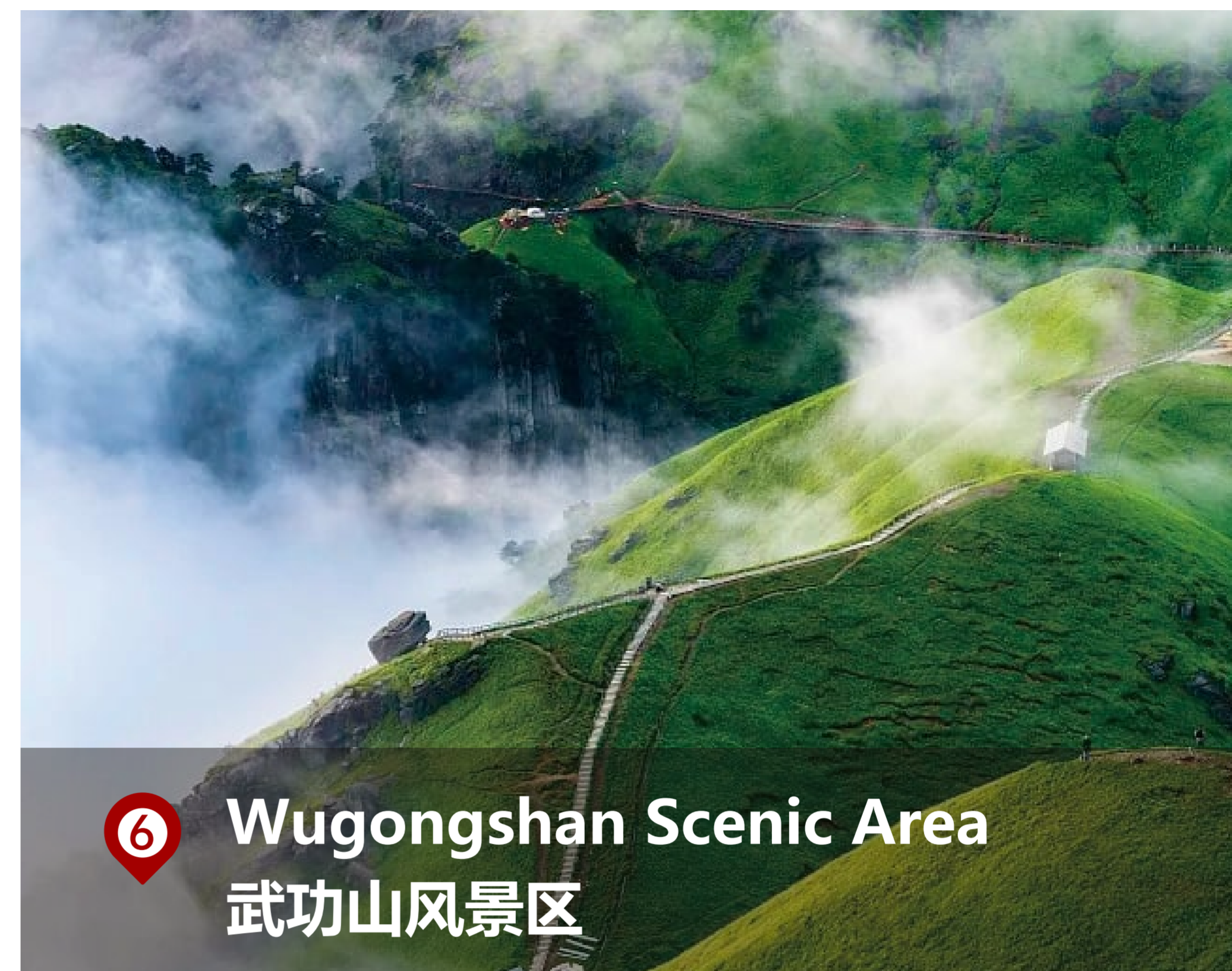
⑥ Wugongshan Scenic Area 武功山风景区