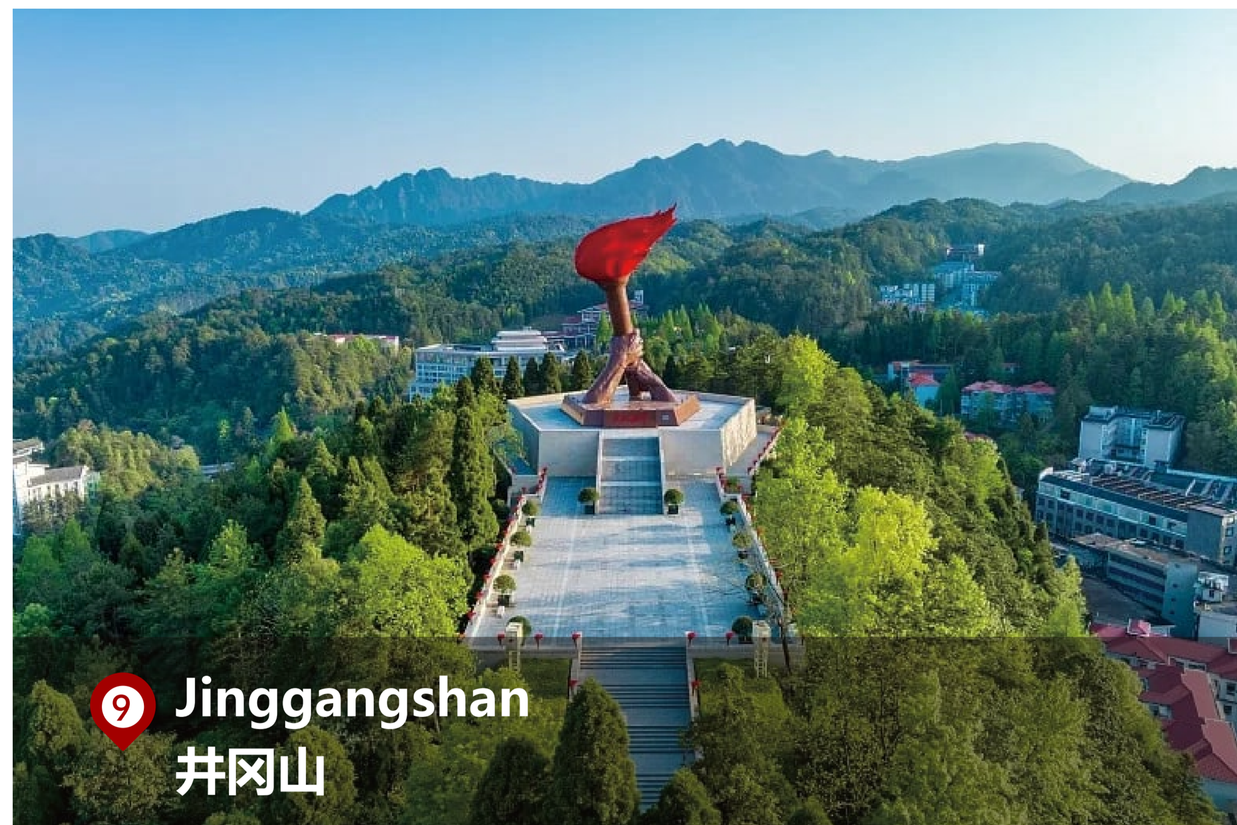
⑨ Jinggangshan 井冈山