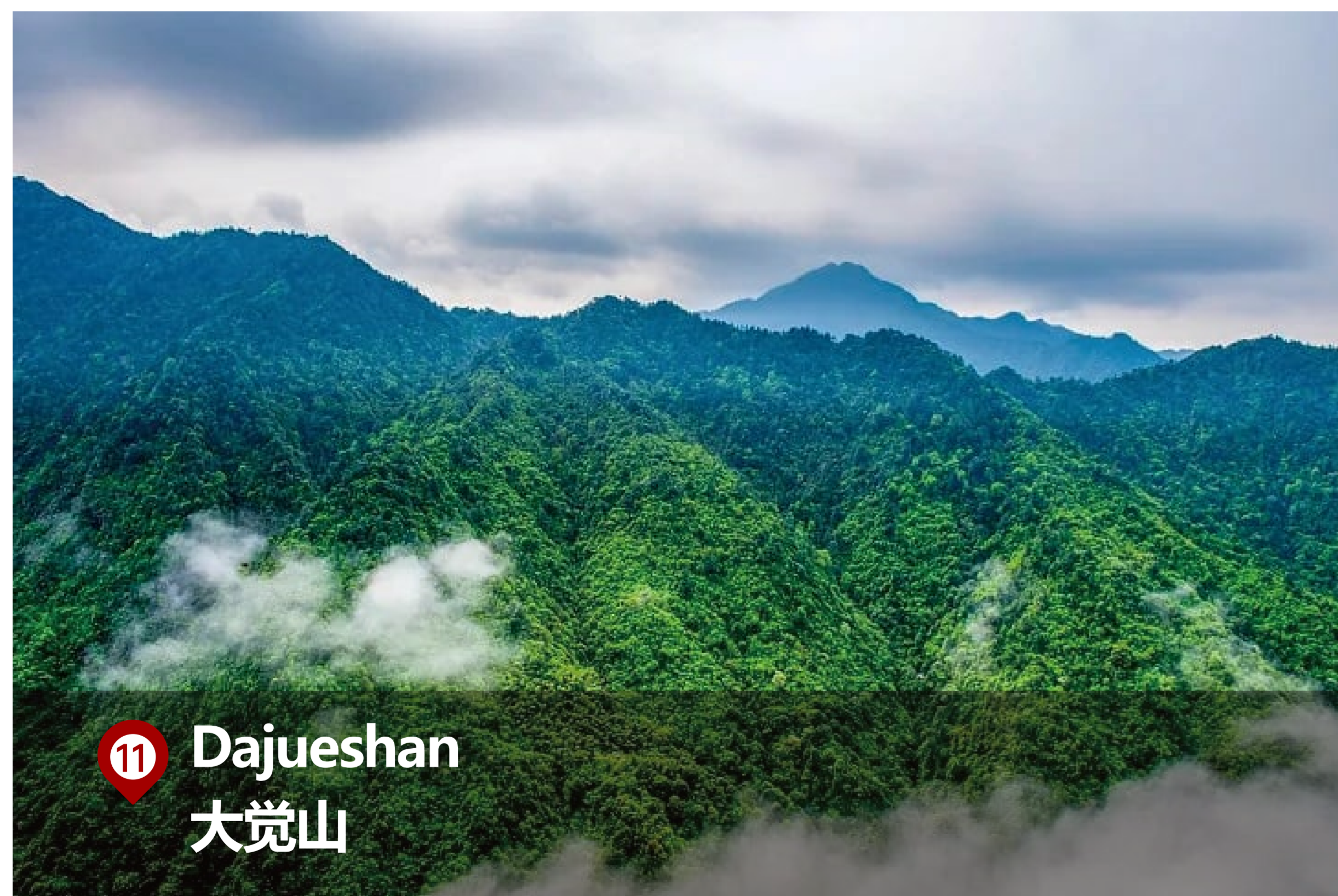
⑪ Dajueshan 大觉山