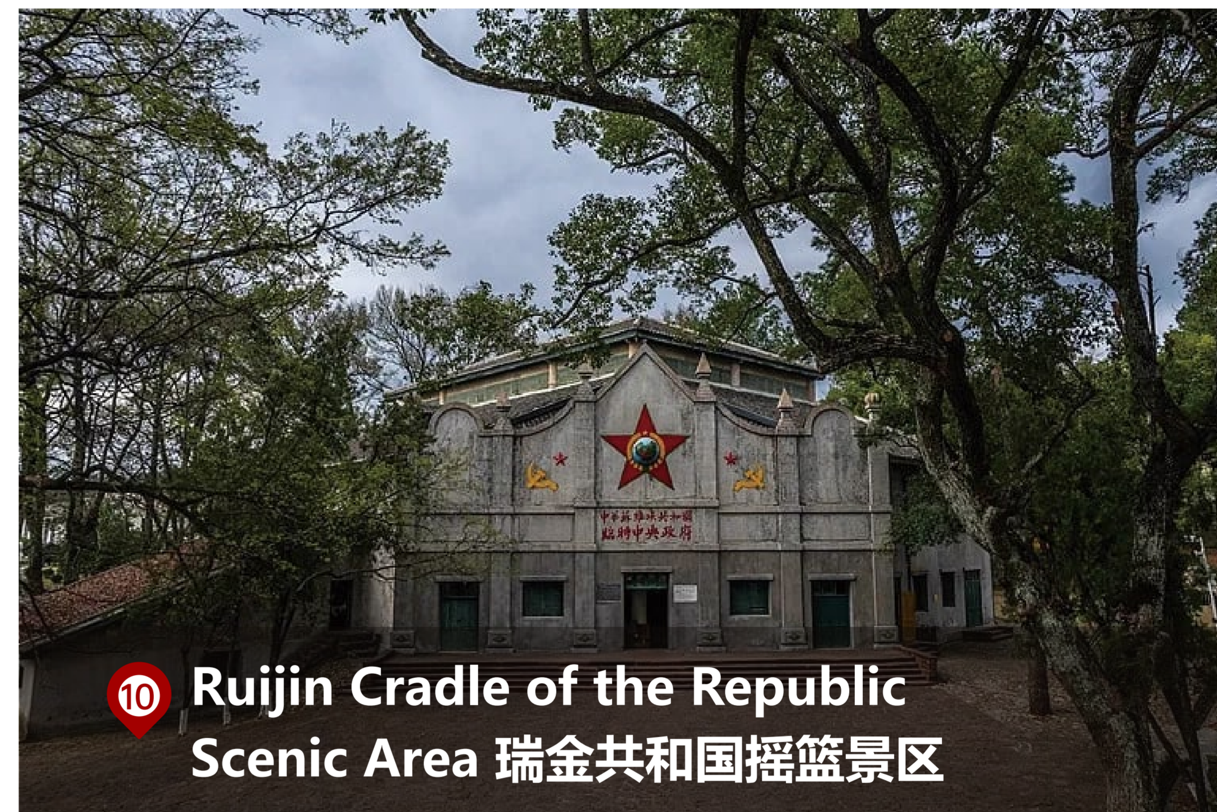
⑩ Ruijin Cradle of the Republic Scenic Area 瑞金共和国摇篮景区