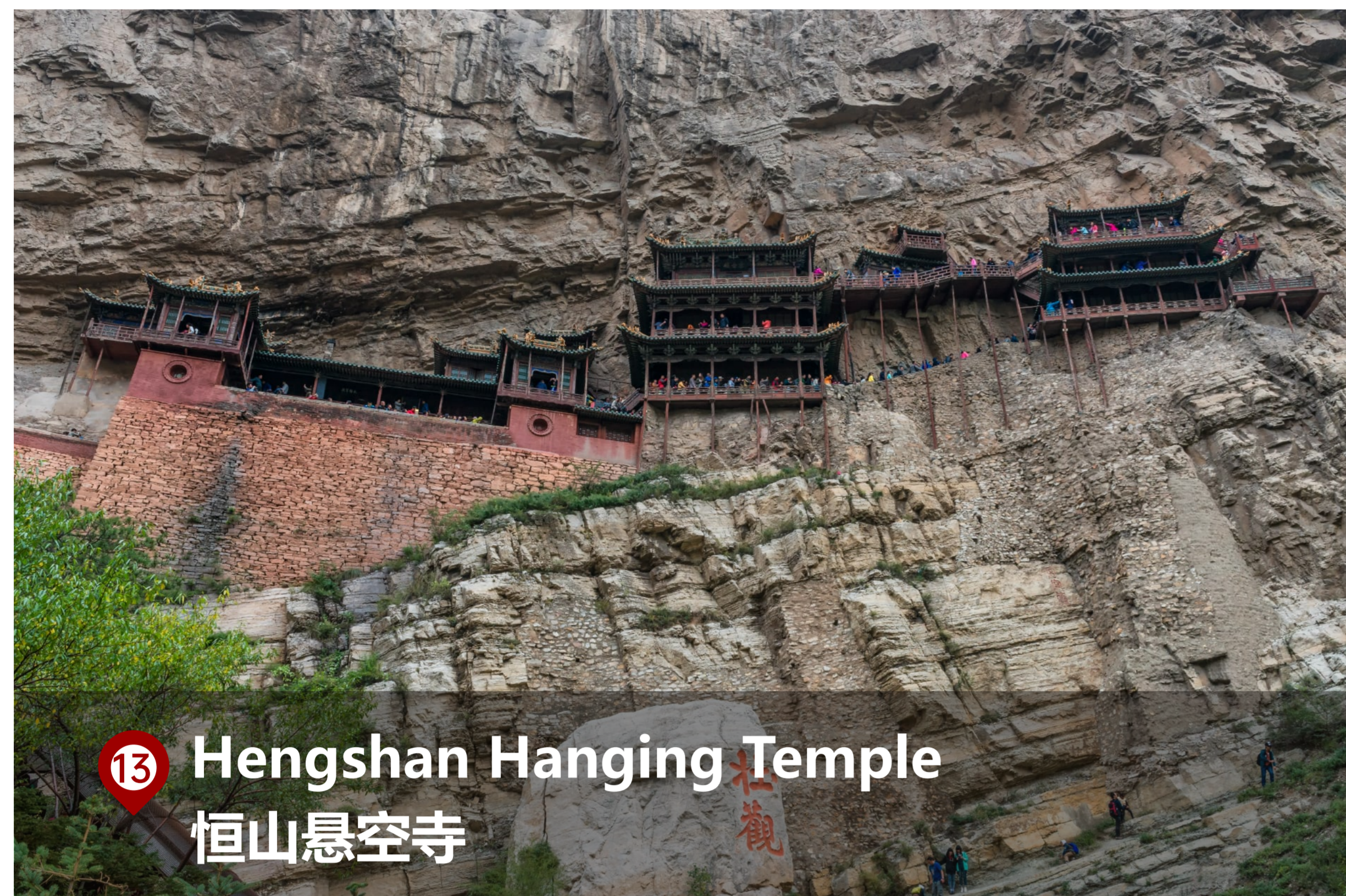
13 Hengshan Hanging Temple 恒山悬空寺