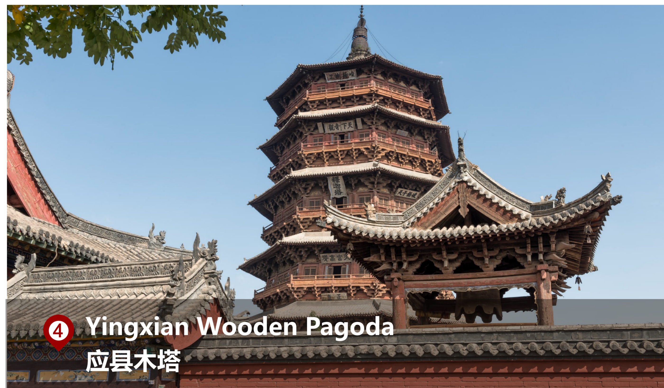
④ Yingxian Wooden Pagoda 应县木塔