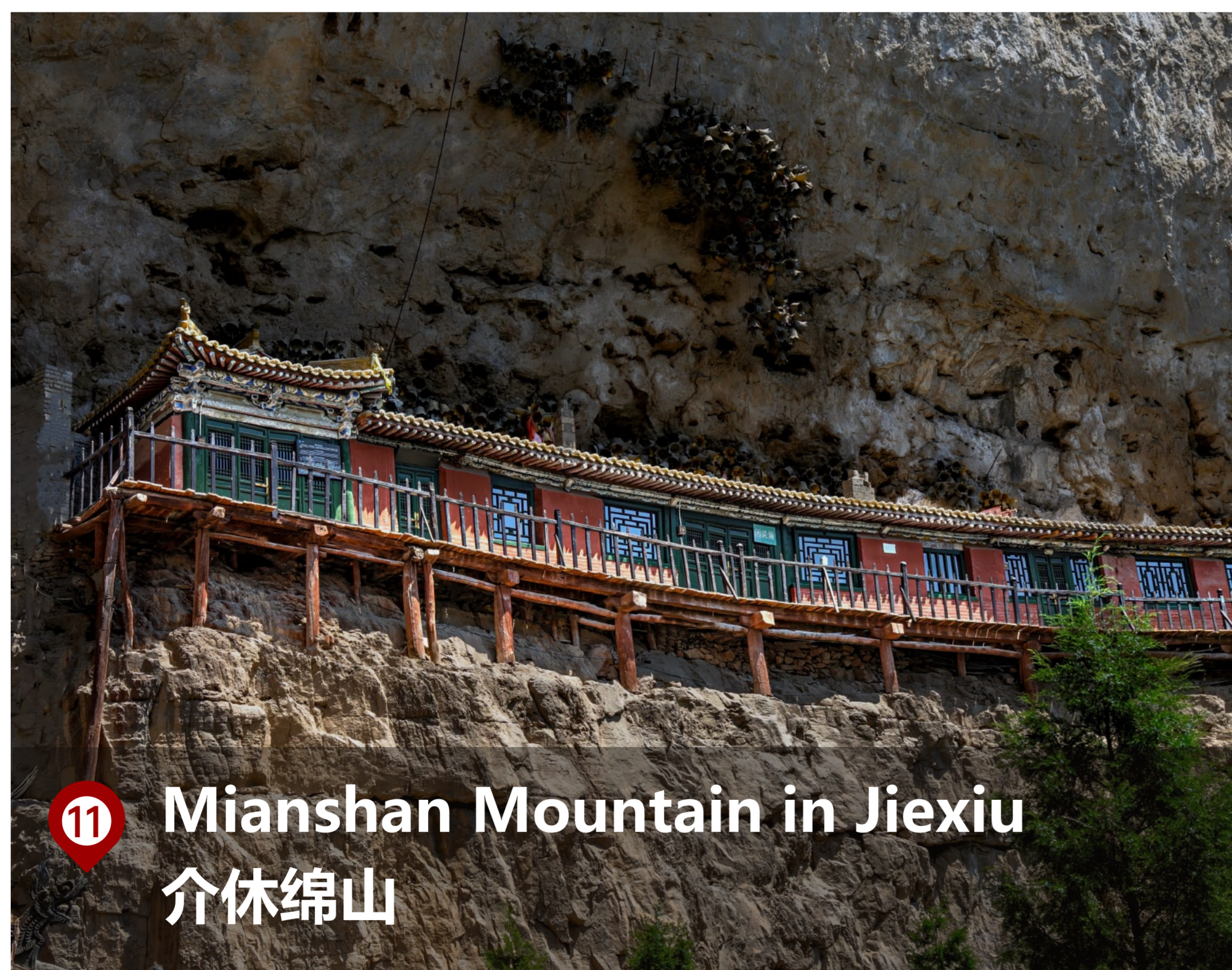
11 Mianshan Mountain in Jiexiu 介休绵山