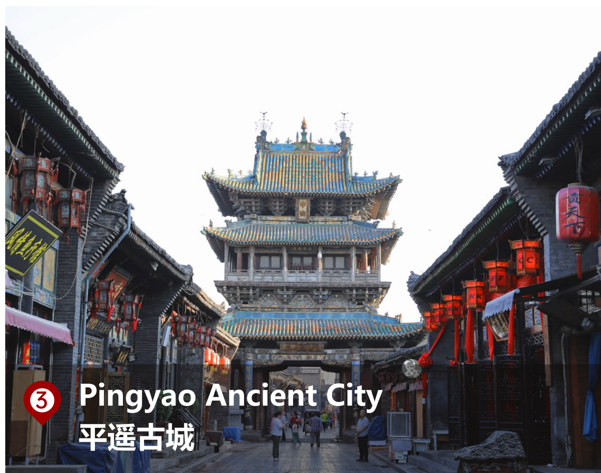
③ Pingyao Ancient City 平遥古城