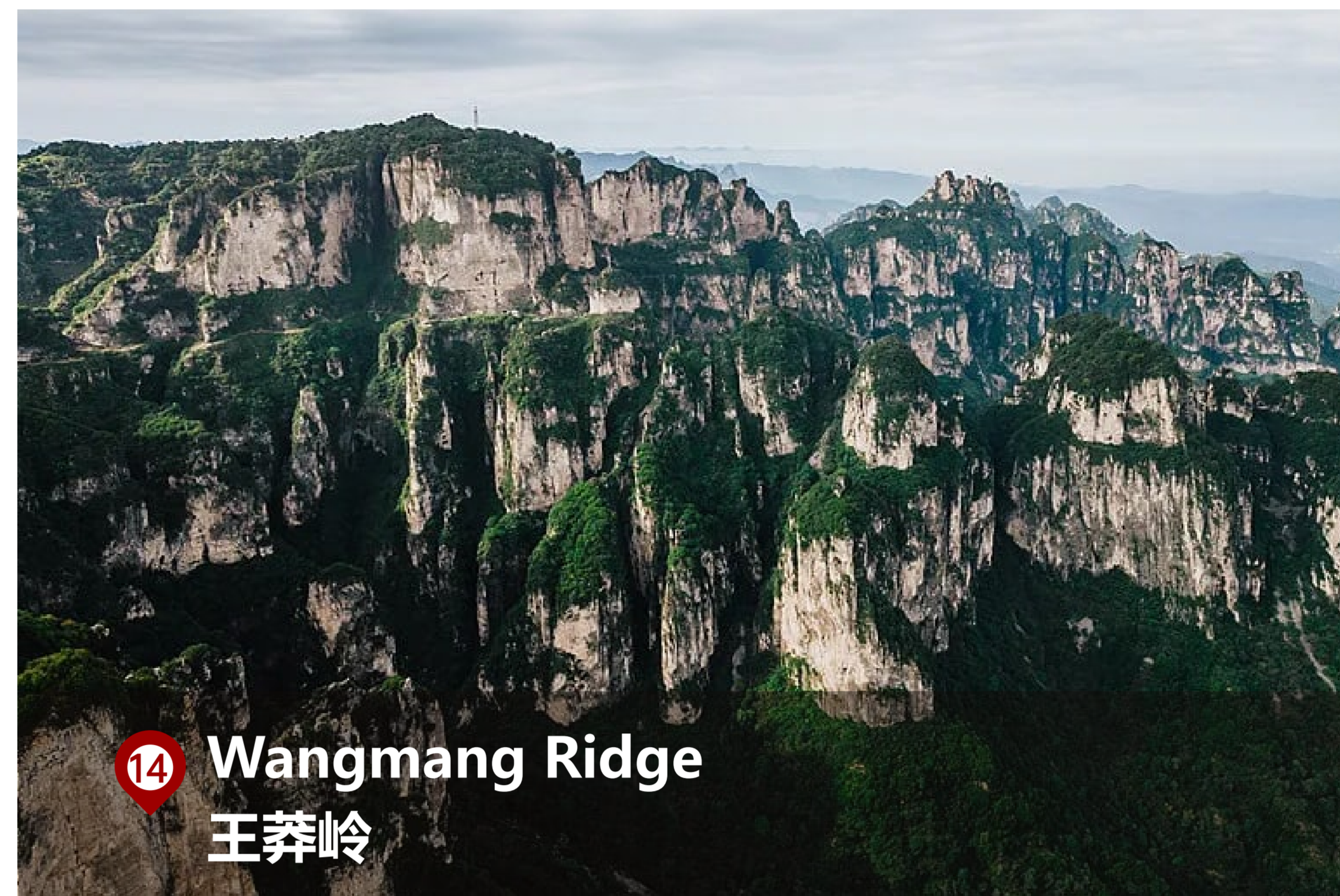
14 Wangmang Ridge 王莽岭