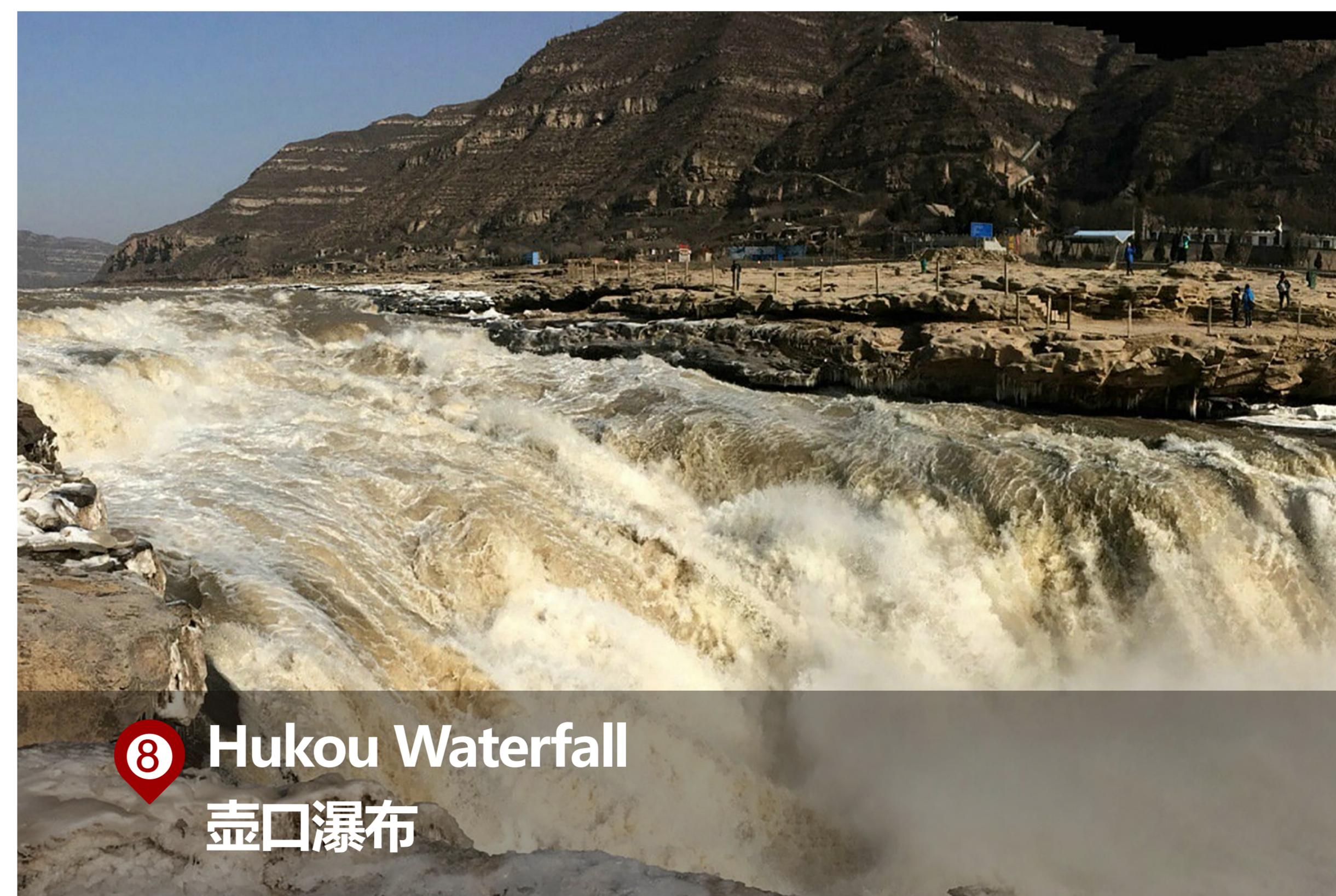
⑧ Hukou Waterfall 壶口瀑布