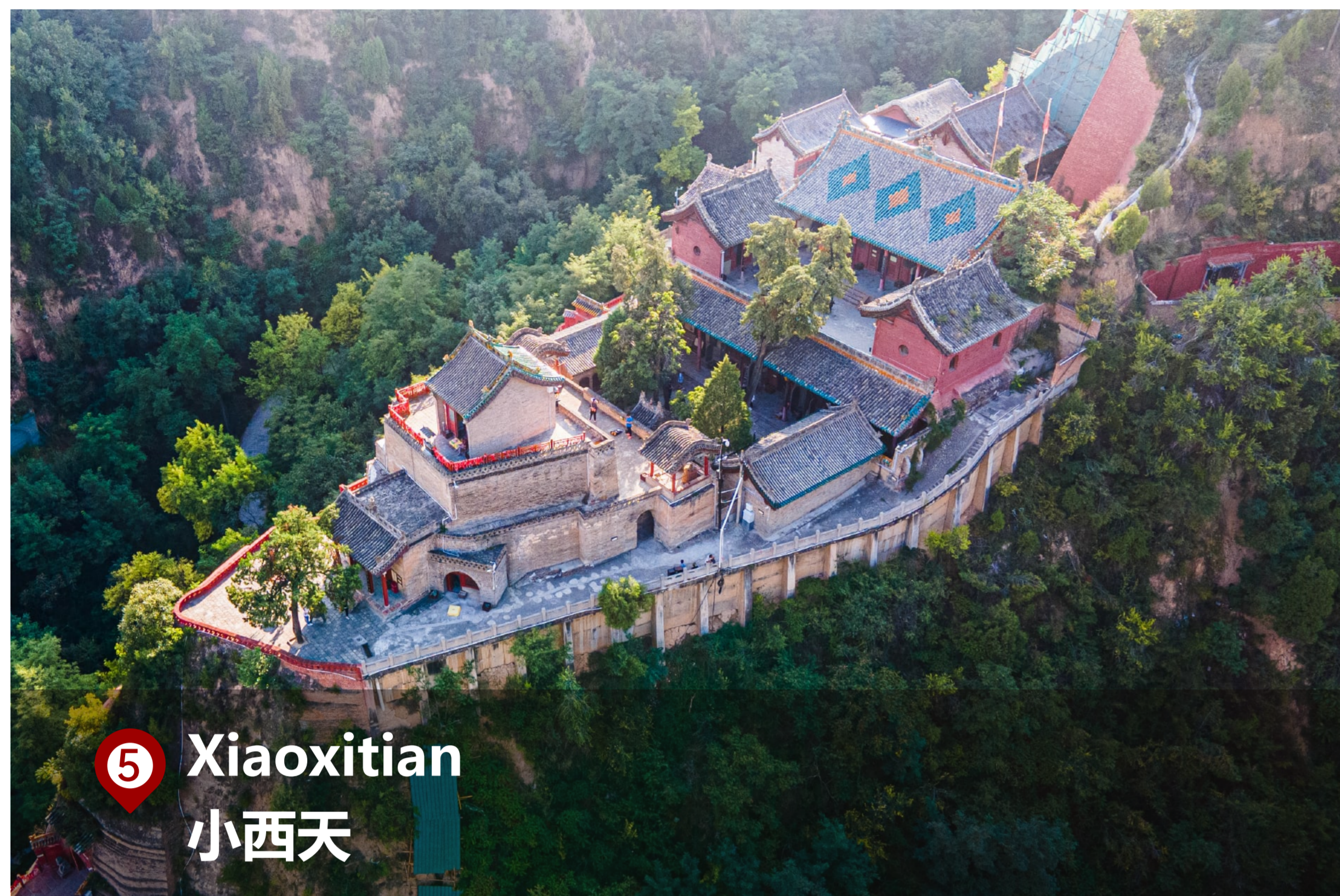
⑤ Xiaoxitian 小西天