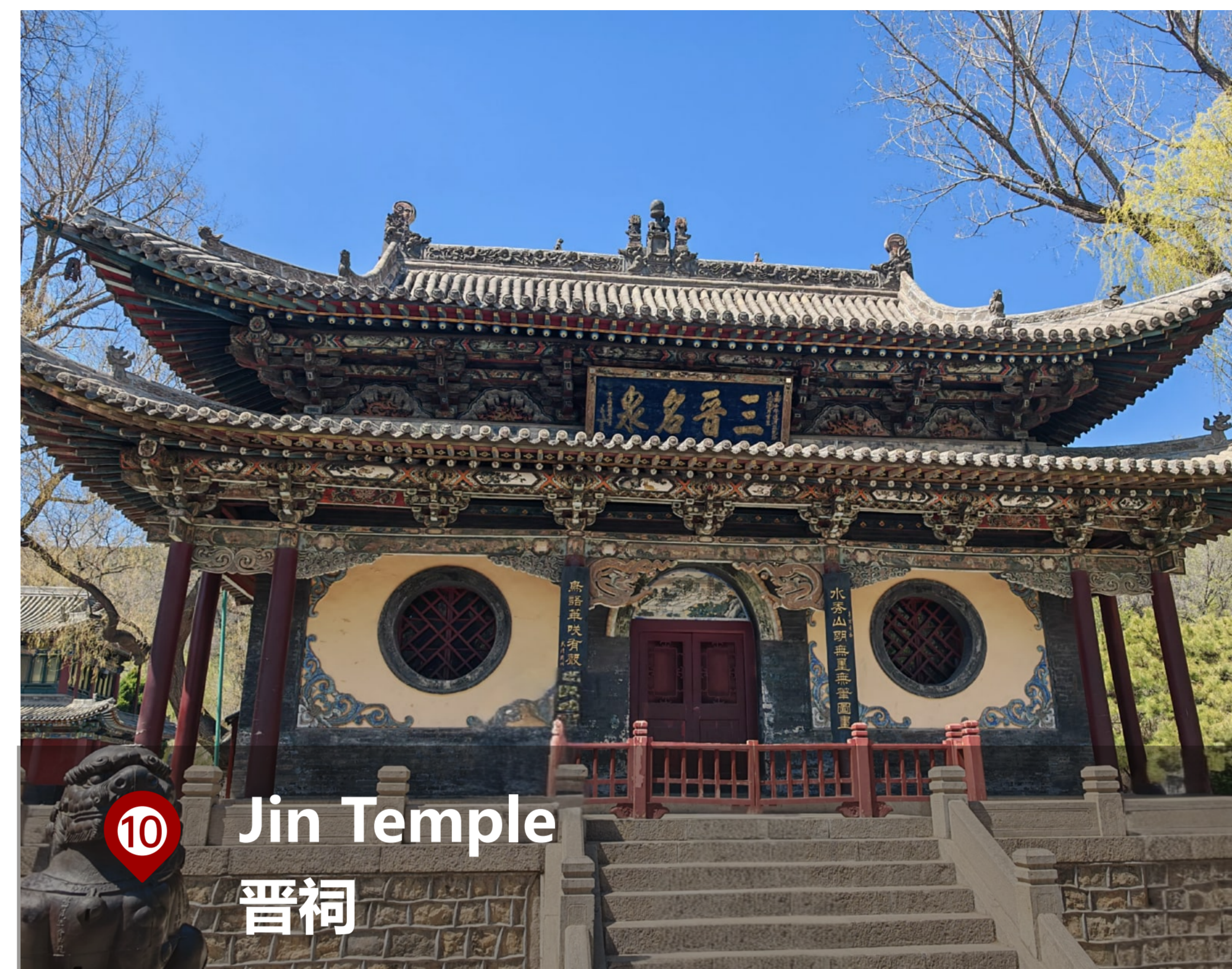
10 Jin Temple 晋祠