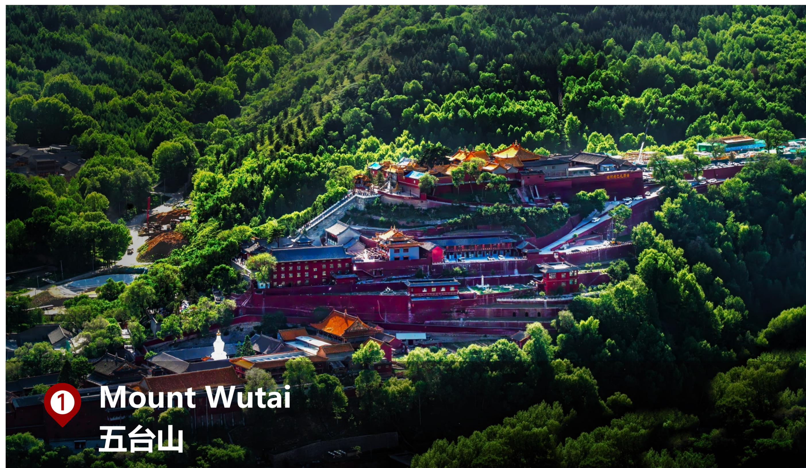
① Mount Wutai 五台山