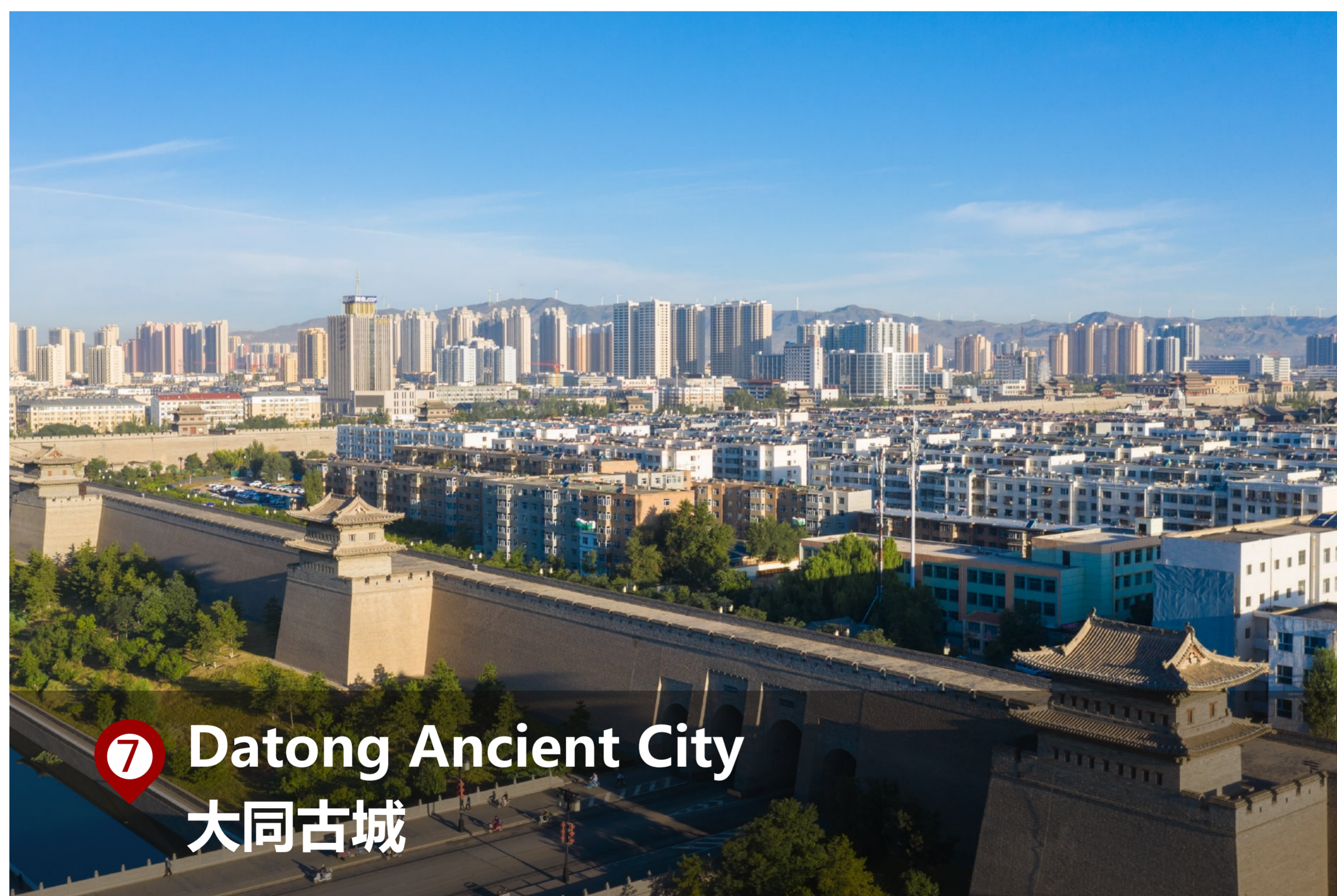
⑦ Datong Ancient City 大同古城