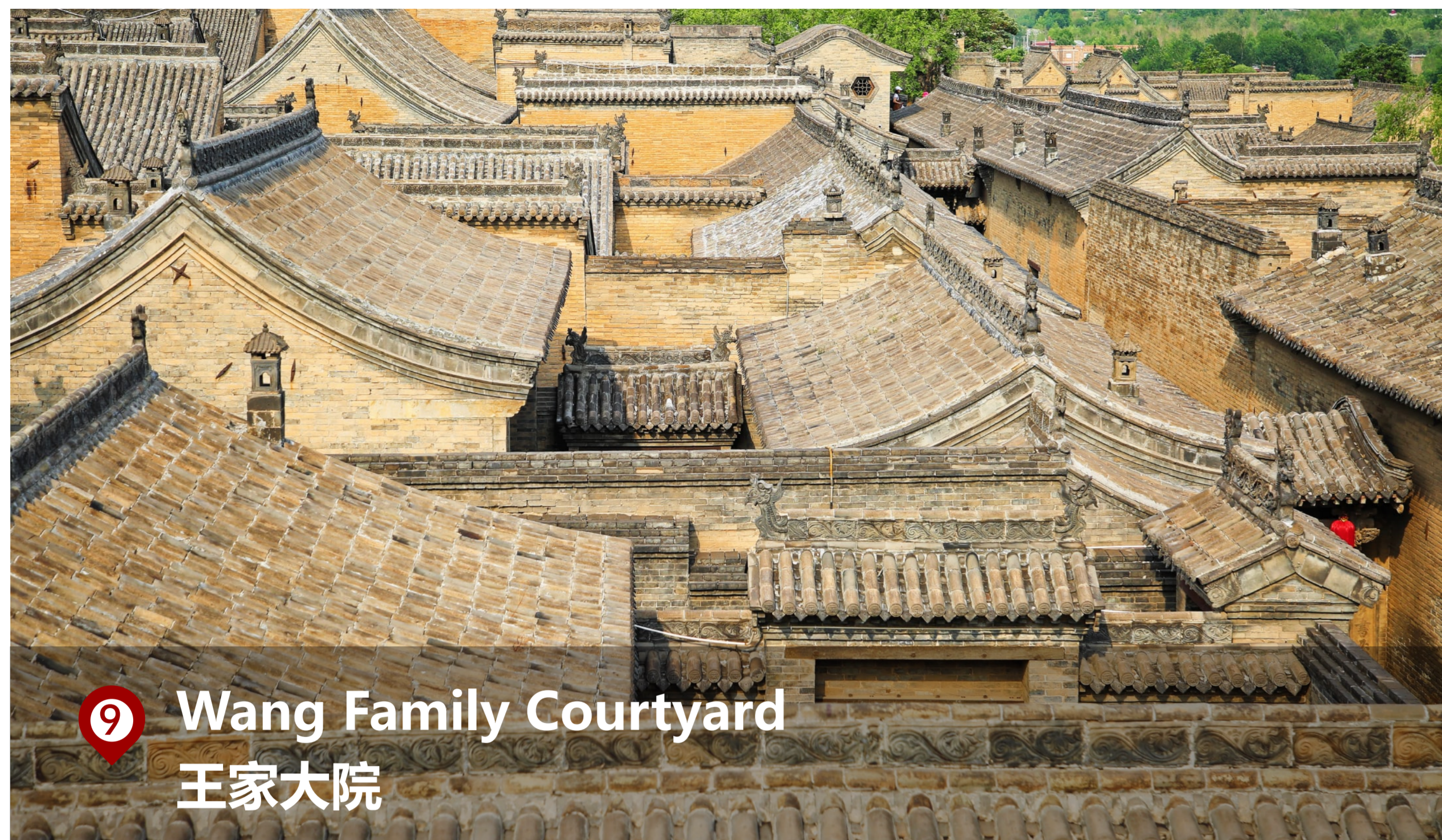
9 Wang Family Courtyard 王家大院