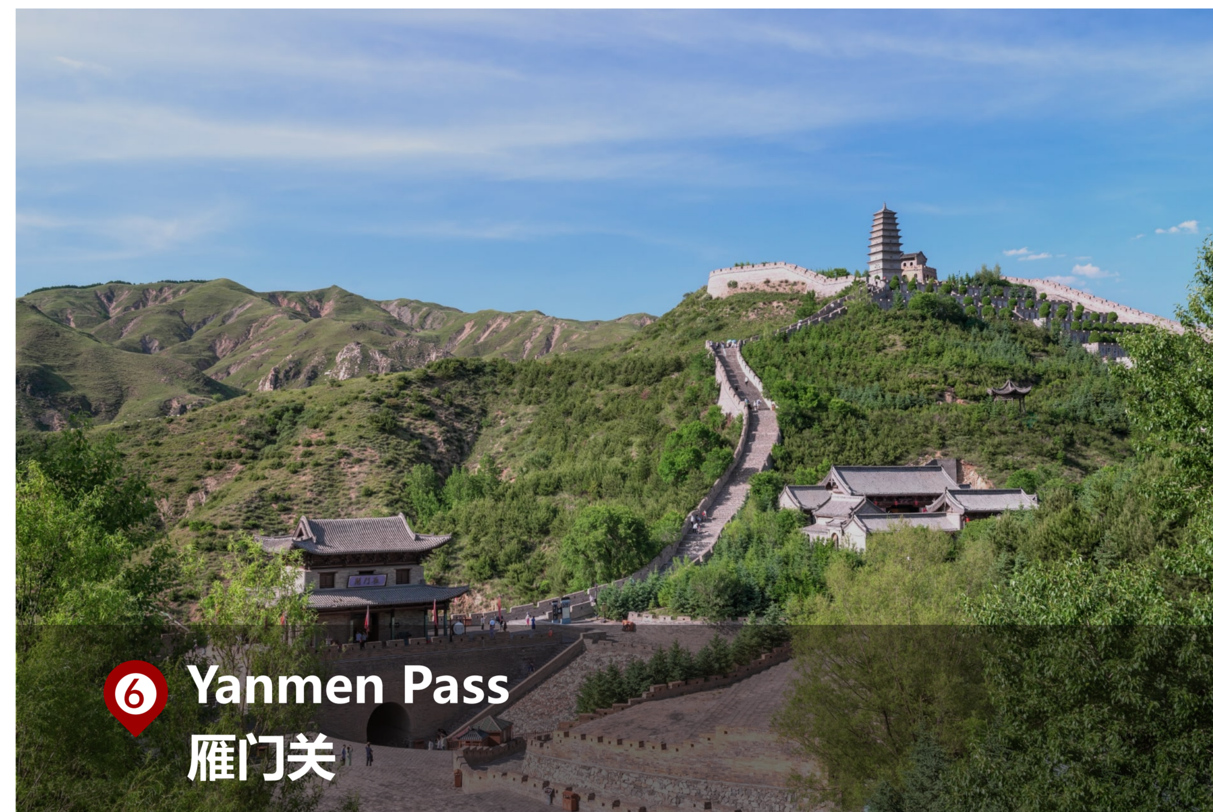
⑥ Yanmen Pass 雁门关