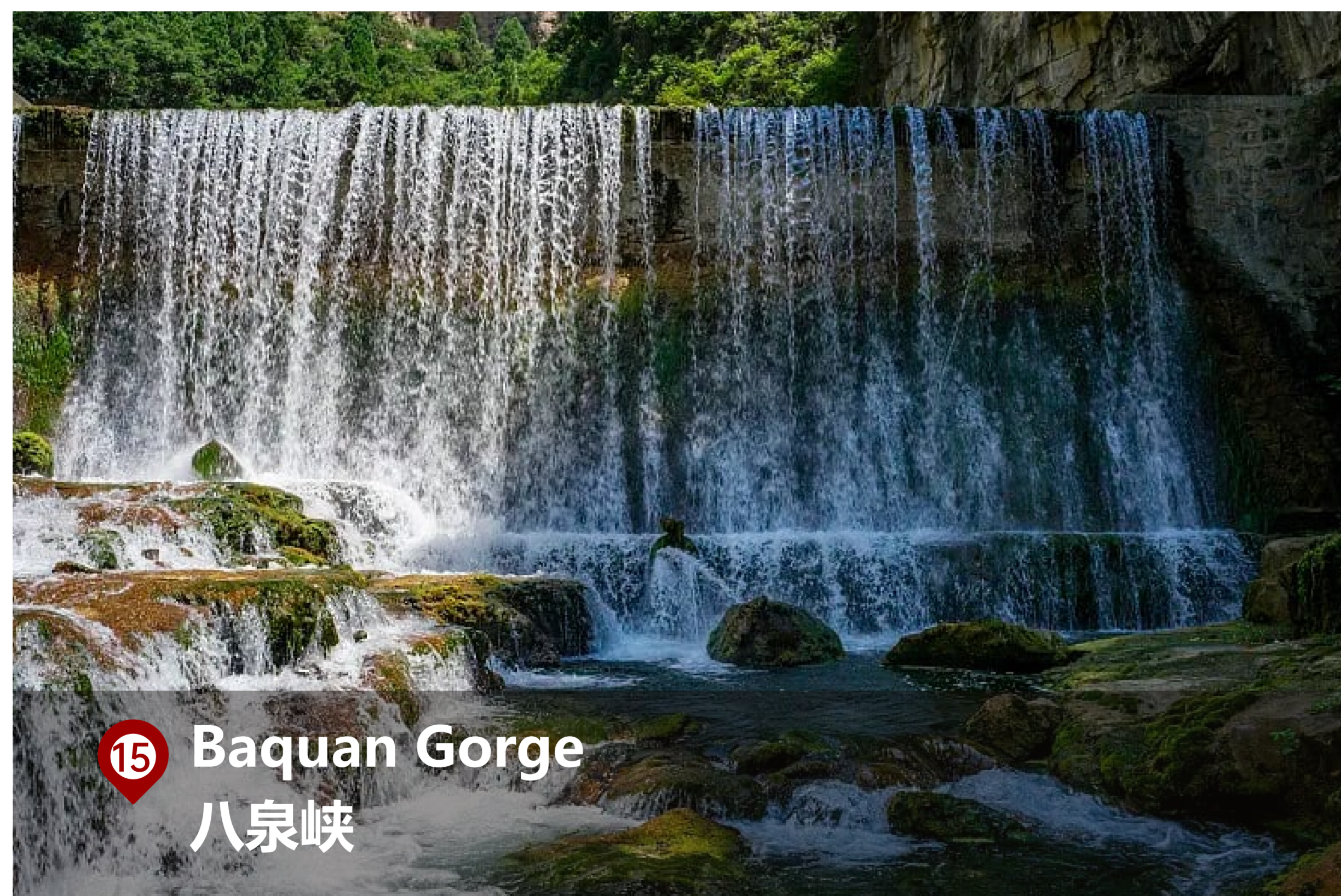
15 Baquan Gorge 八泉峡