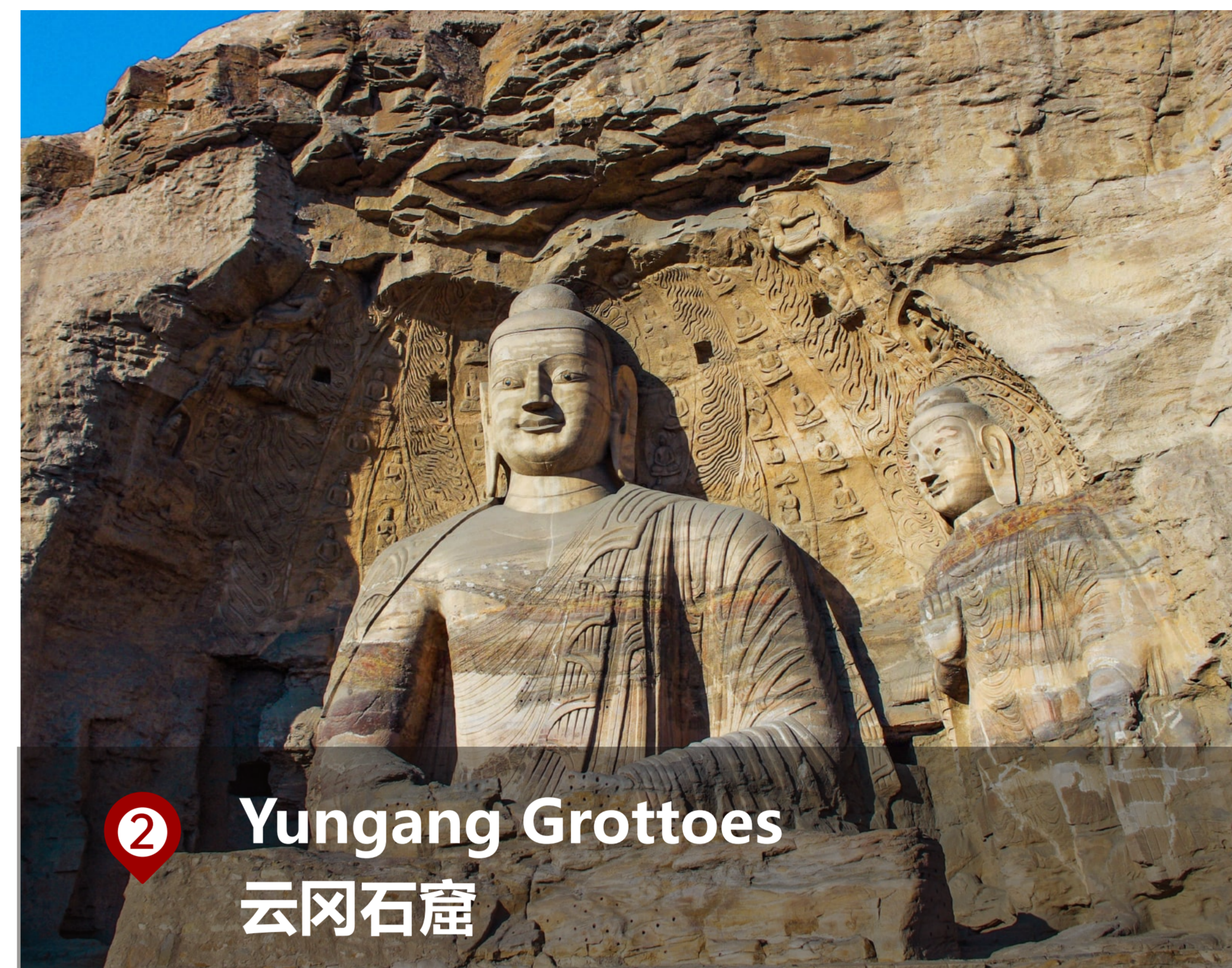
② Yungang Grottoes 云冈石窟