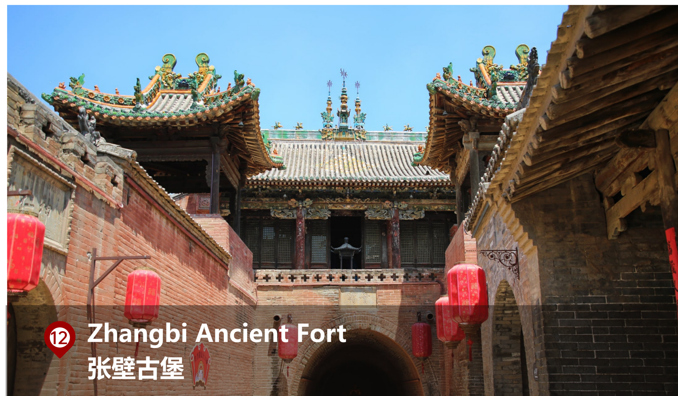
12 Zhangbi Ancient Fort 张壁古堡