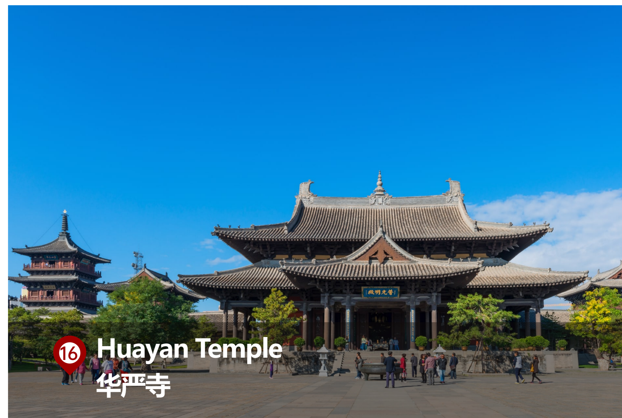
16 Huayan Temple 华严寺