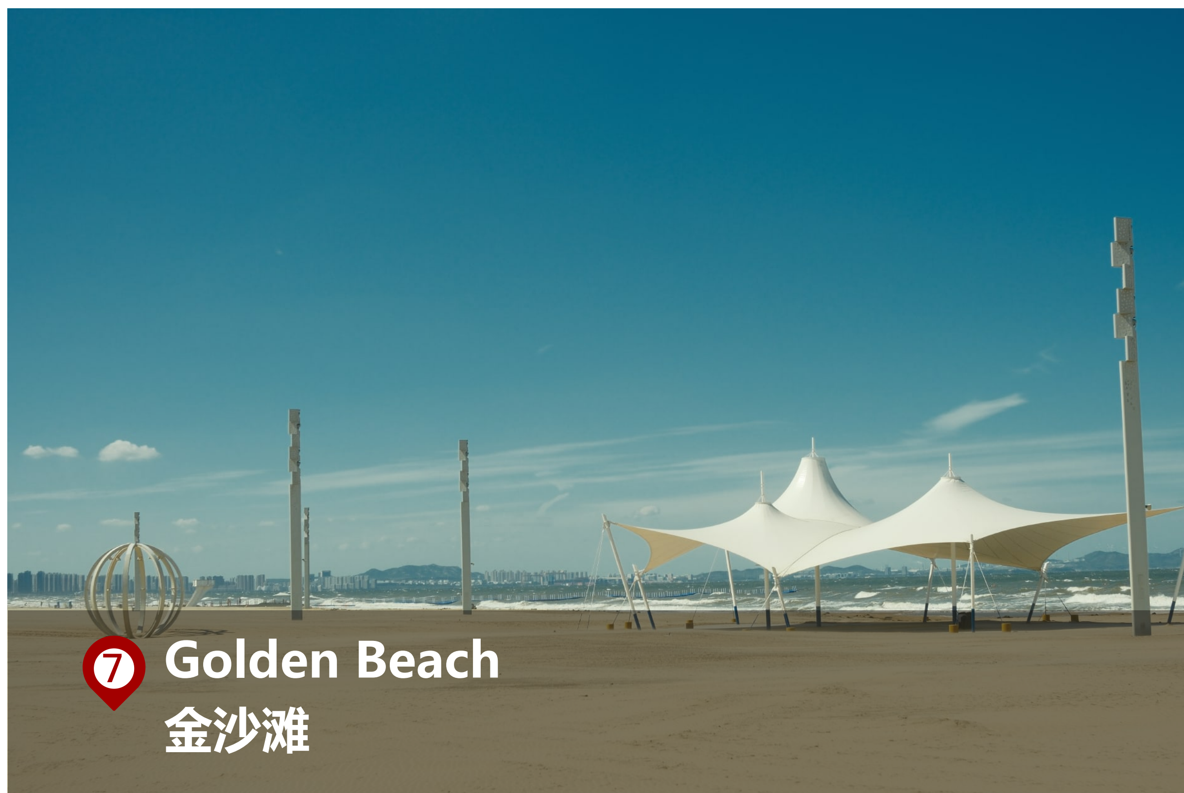
⑦ Golden Beach 金沙滩