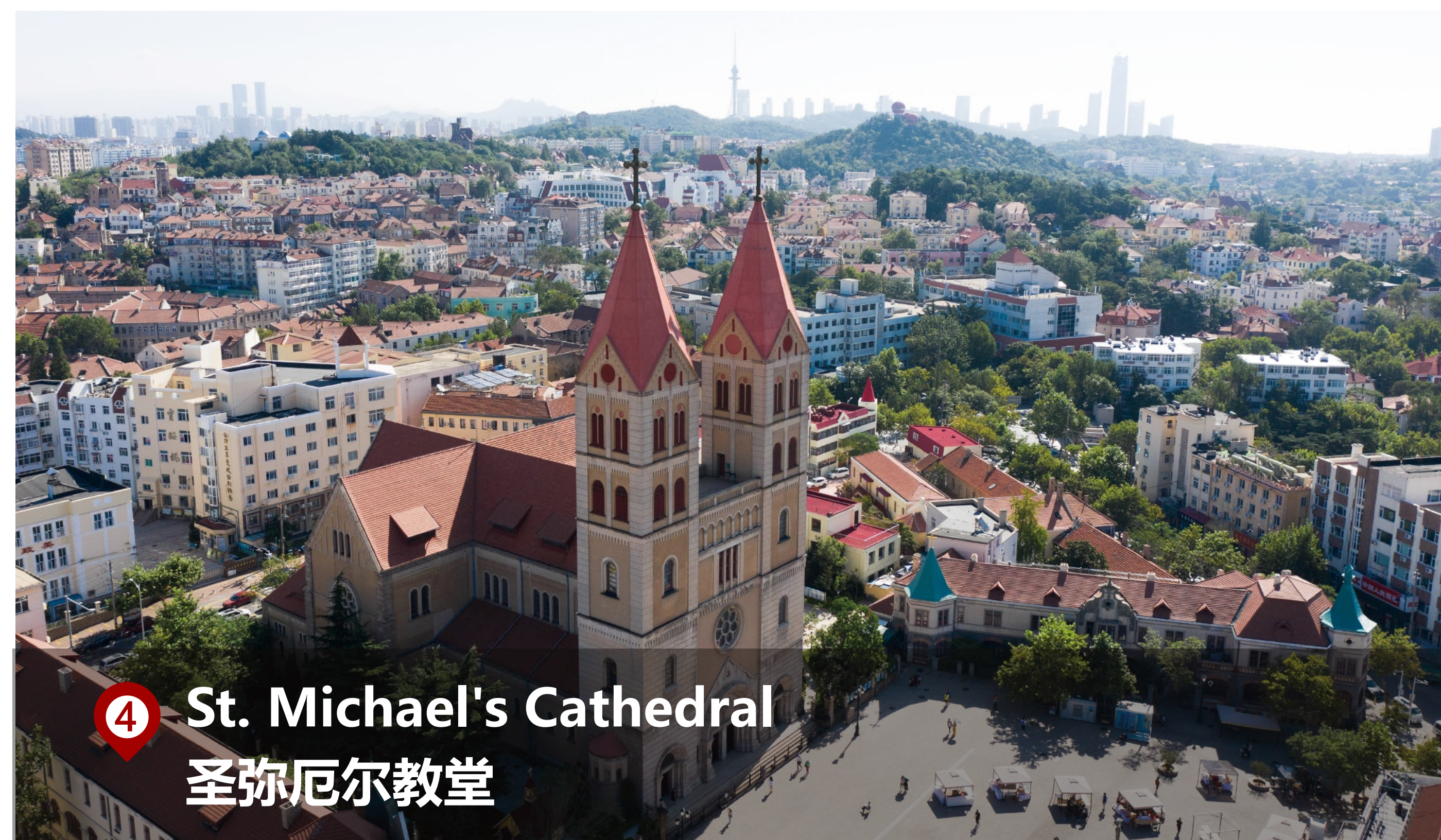
④ St. Michael's Cathedral 圣弥厄尔教堂