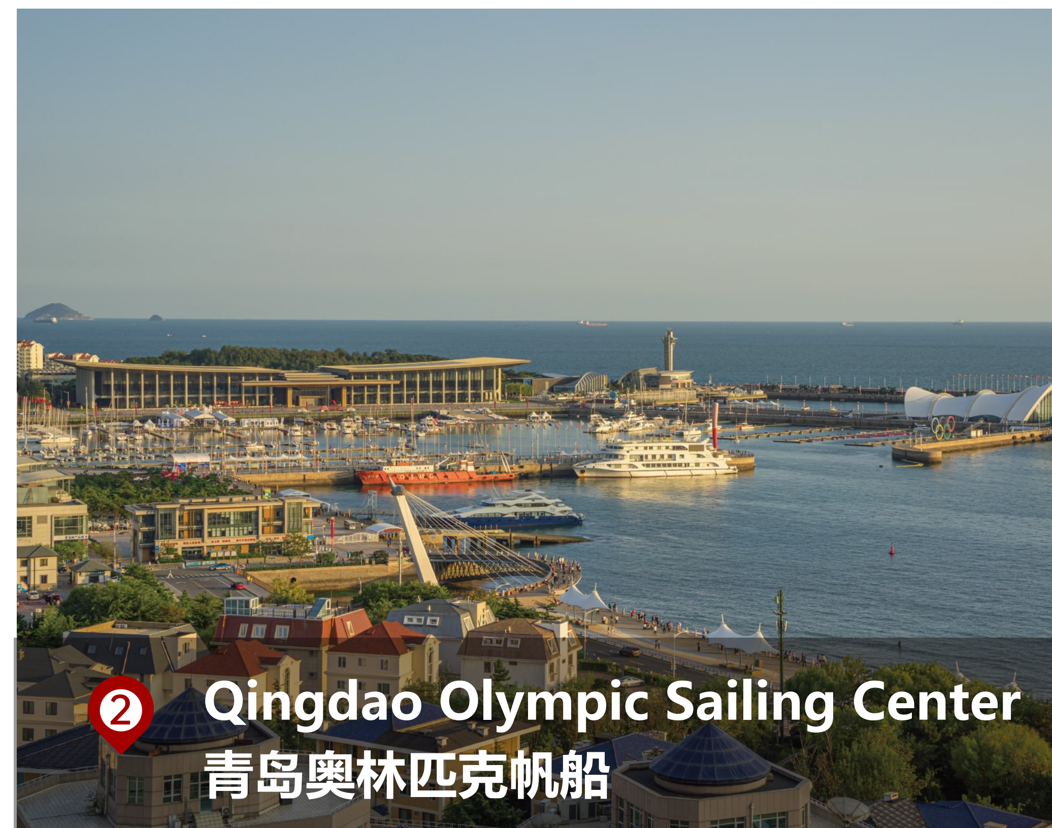
② Qingdao Olympic Sailing Center 青岛奥林匹克帆船