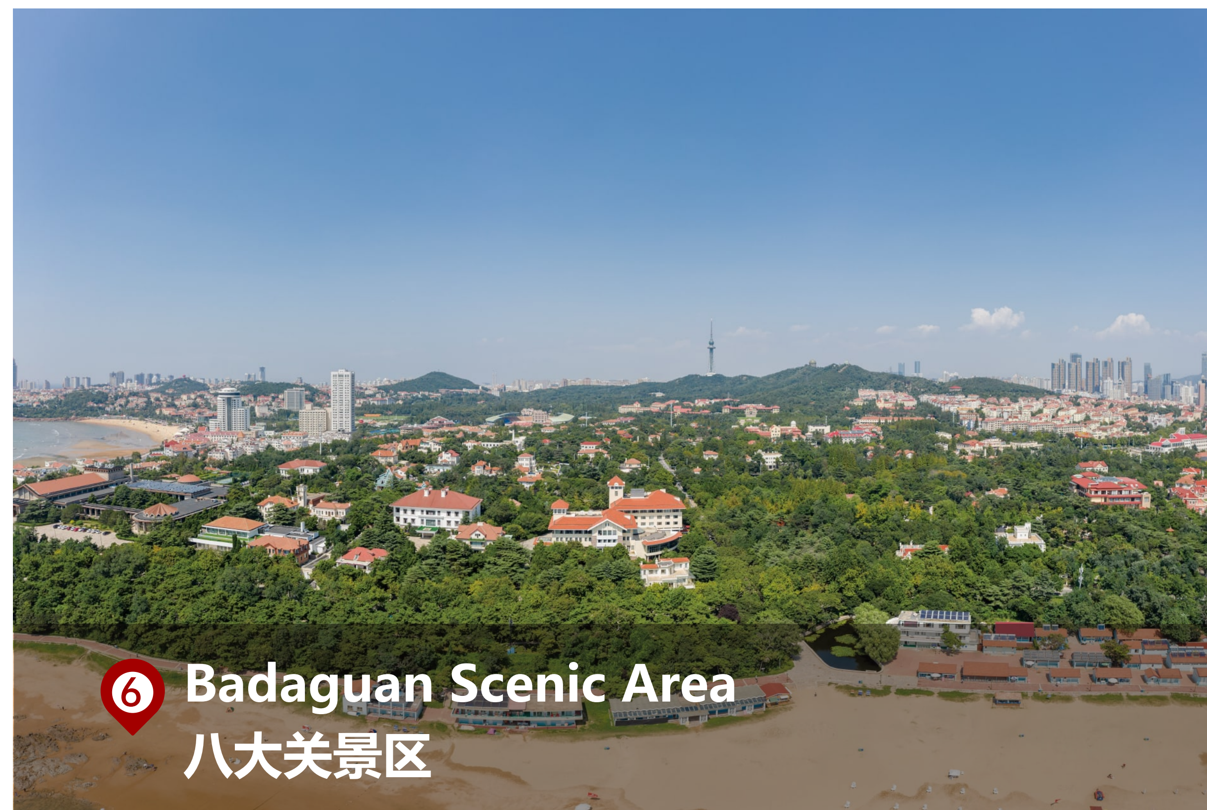
⑥ Badaguan Scenic Area 八大关景区