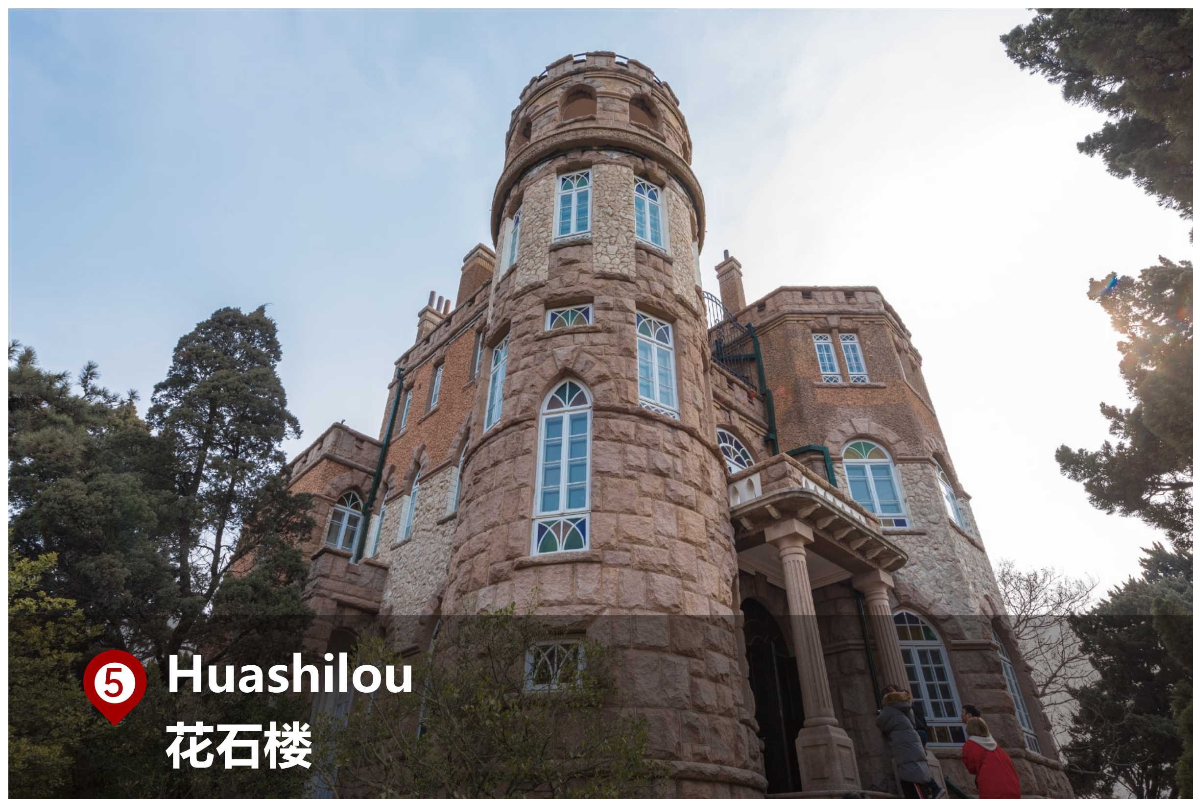
⑤ Huashilou 花石楼