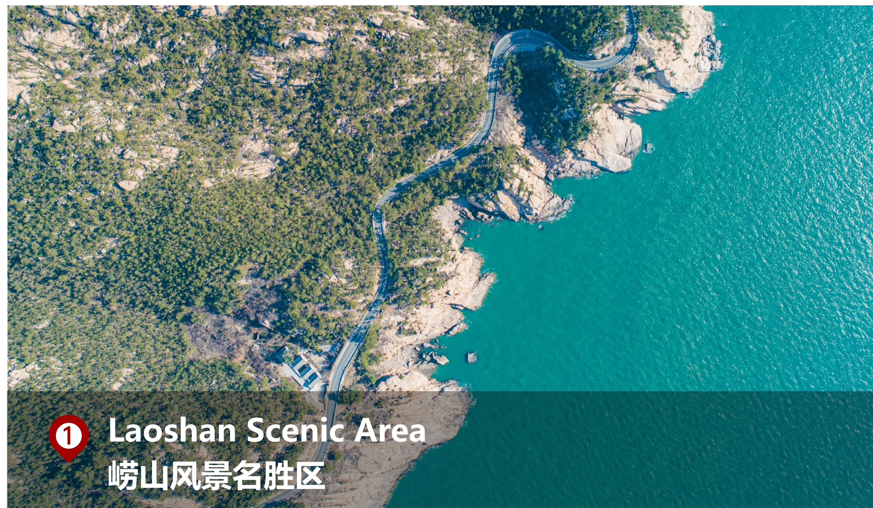
① Laoshan Scenic Area 崂山风景名胜区