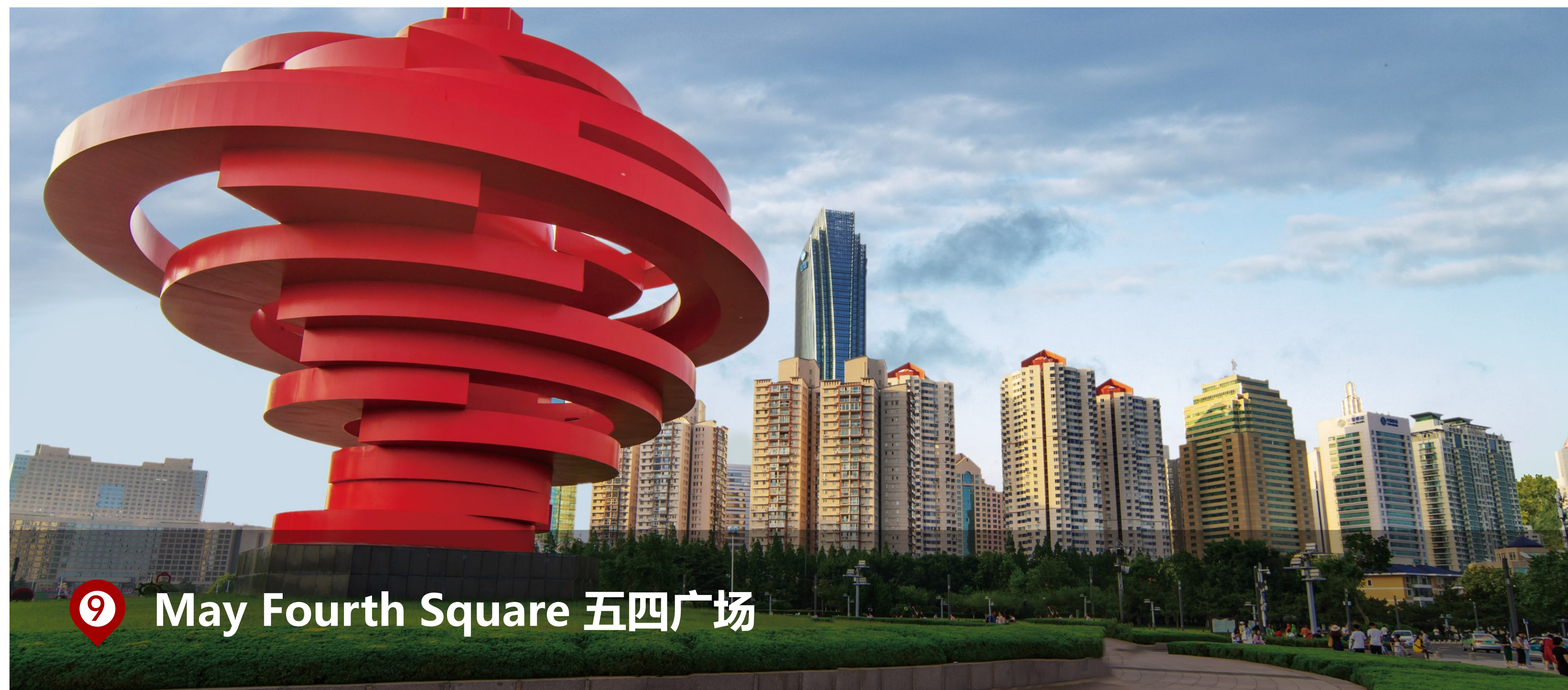
⑨ May Fourth Square 五四广场