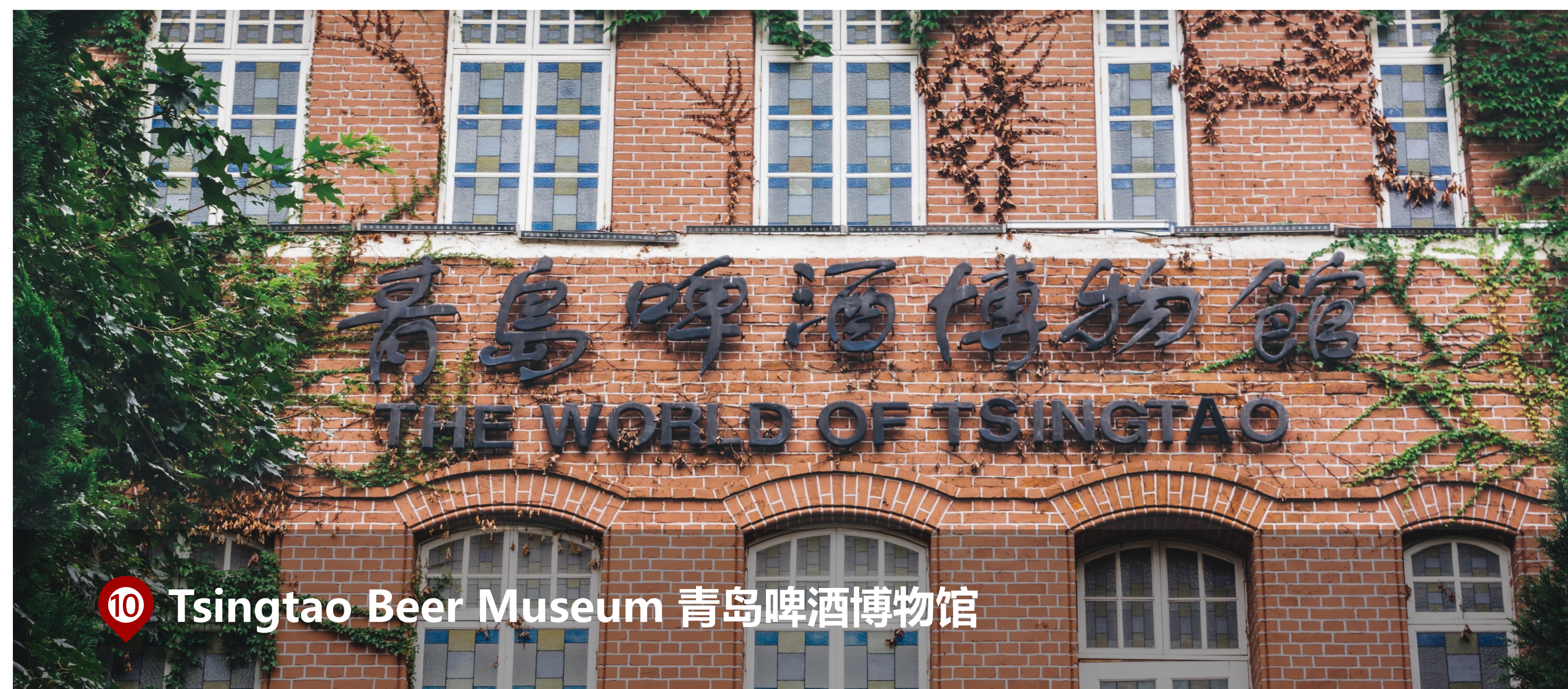
⑩ Tsingtao Beer Museum 青岛啤酒博物馆