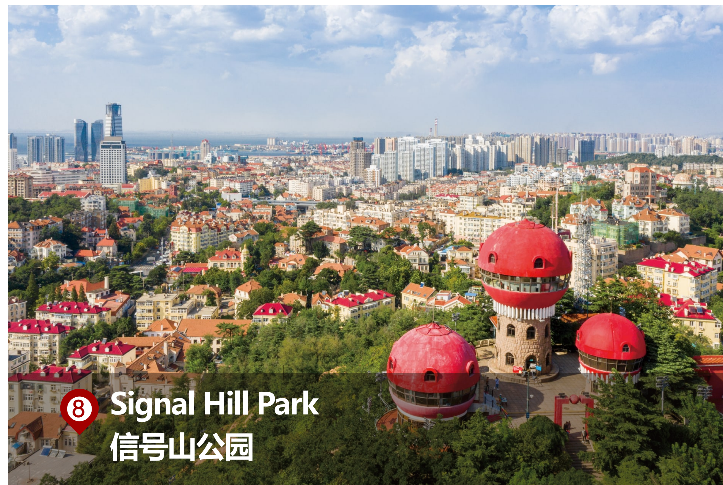
⑧ Signal Hill Park 信号山公园