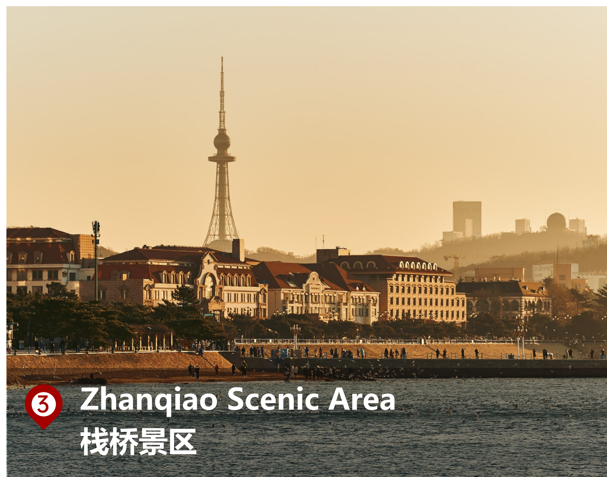
③ Zhanqiao Scenic Area 栈桥景区