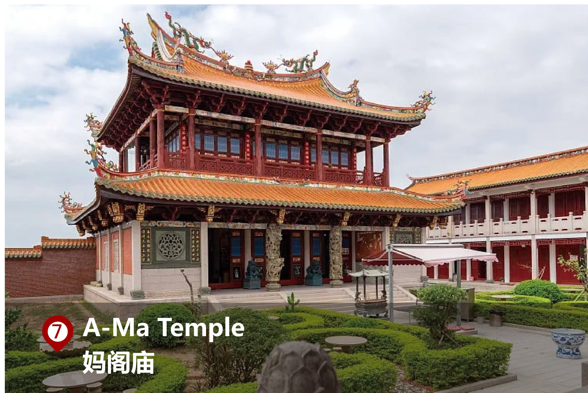
⑦ A-Ma Temple 妈阁庙