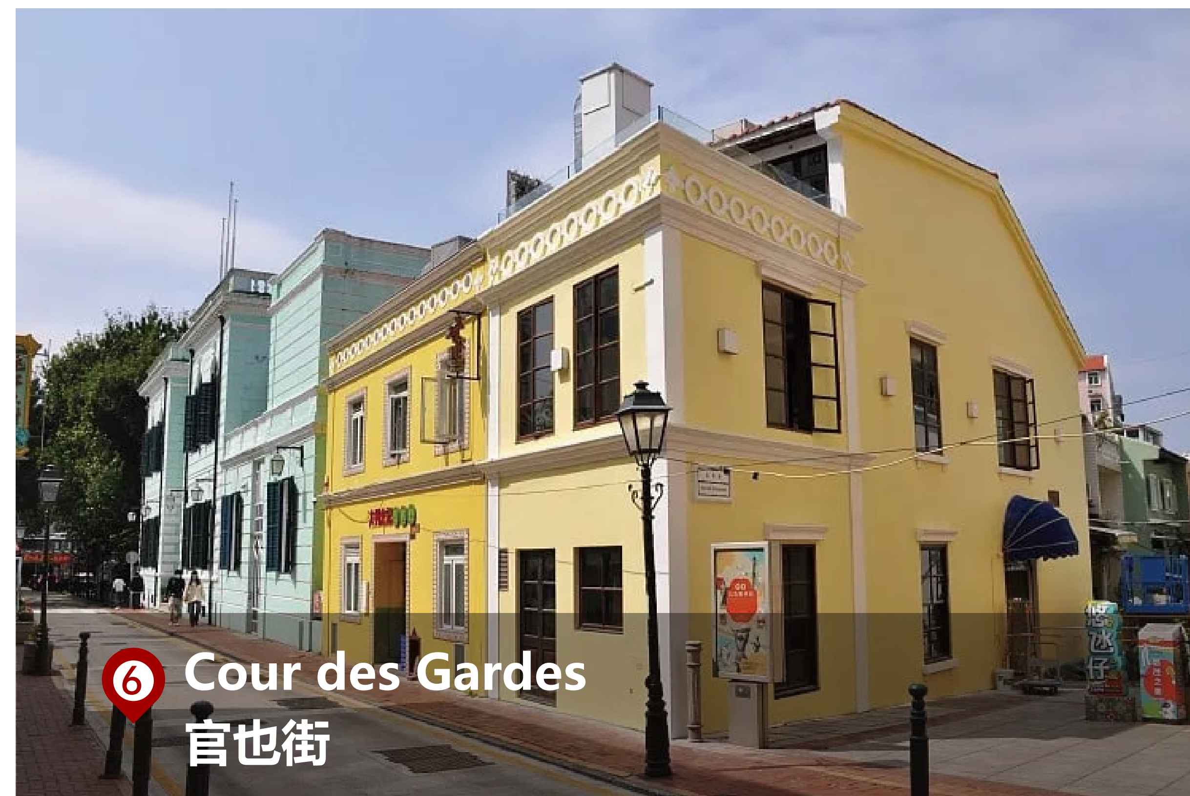
⑥ Cour des Gardes 官也街