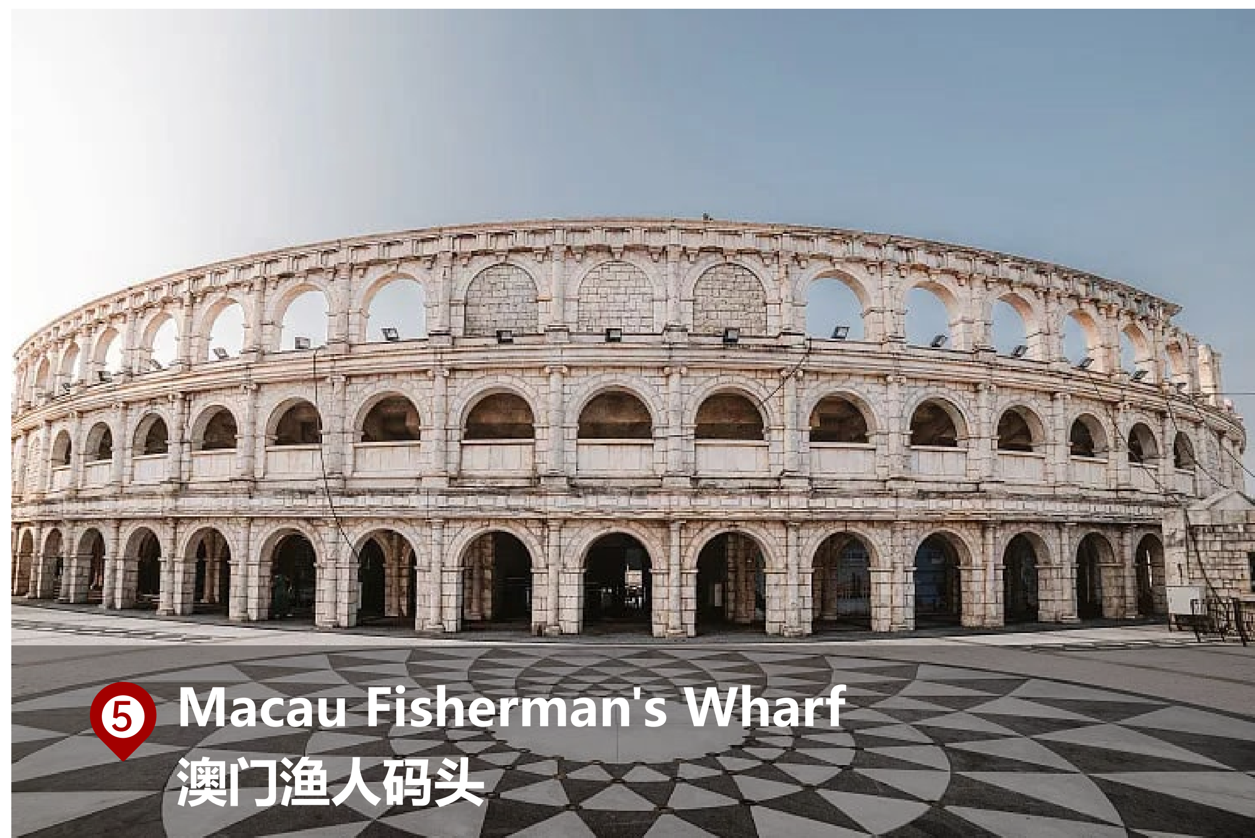
⑤ Macau Fisherman's Wharf 澳门渔人码头