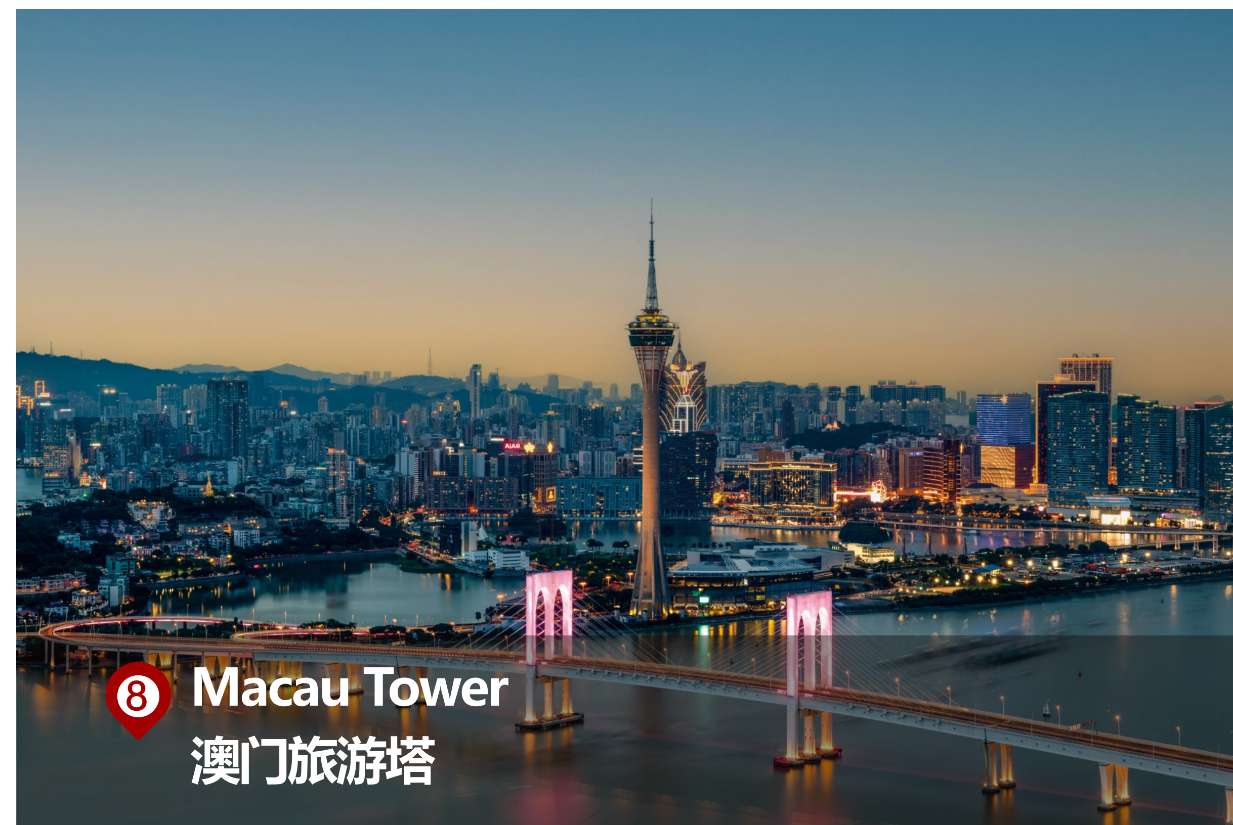
⑧ Macau Tower 澳门旅游塔