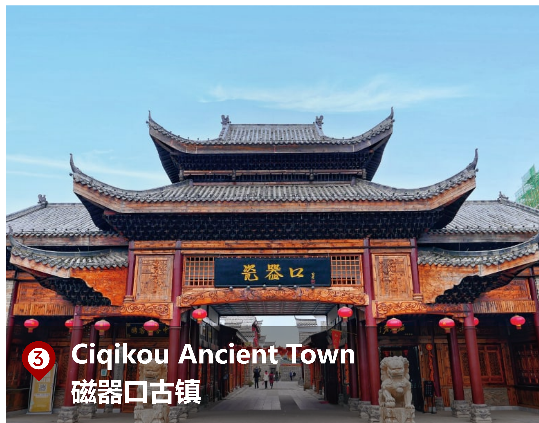
③ Ciqikou Ancient Town 磁器口古镇