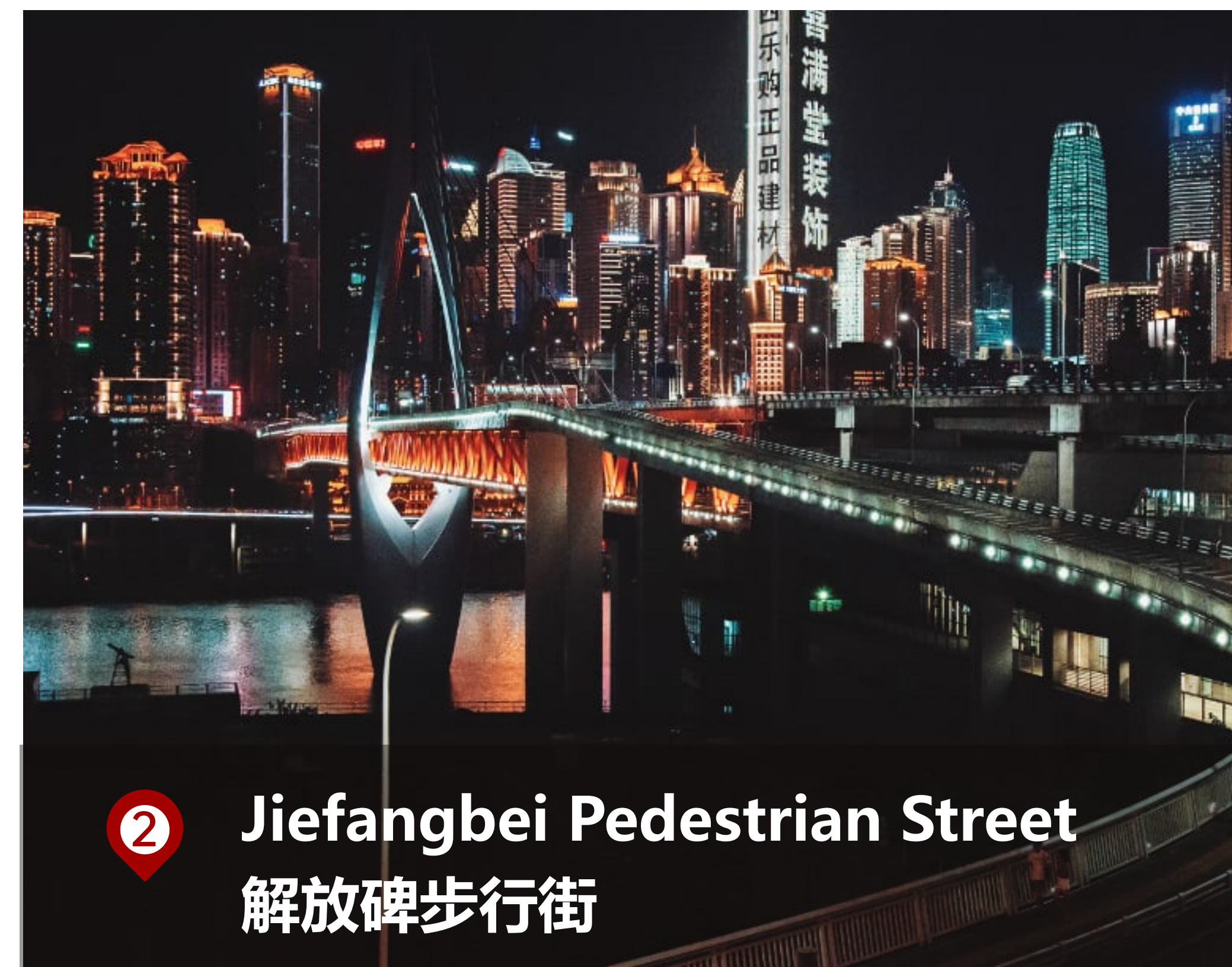
② Jiefangbei Pedestrian Street 解放碑步行街