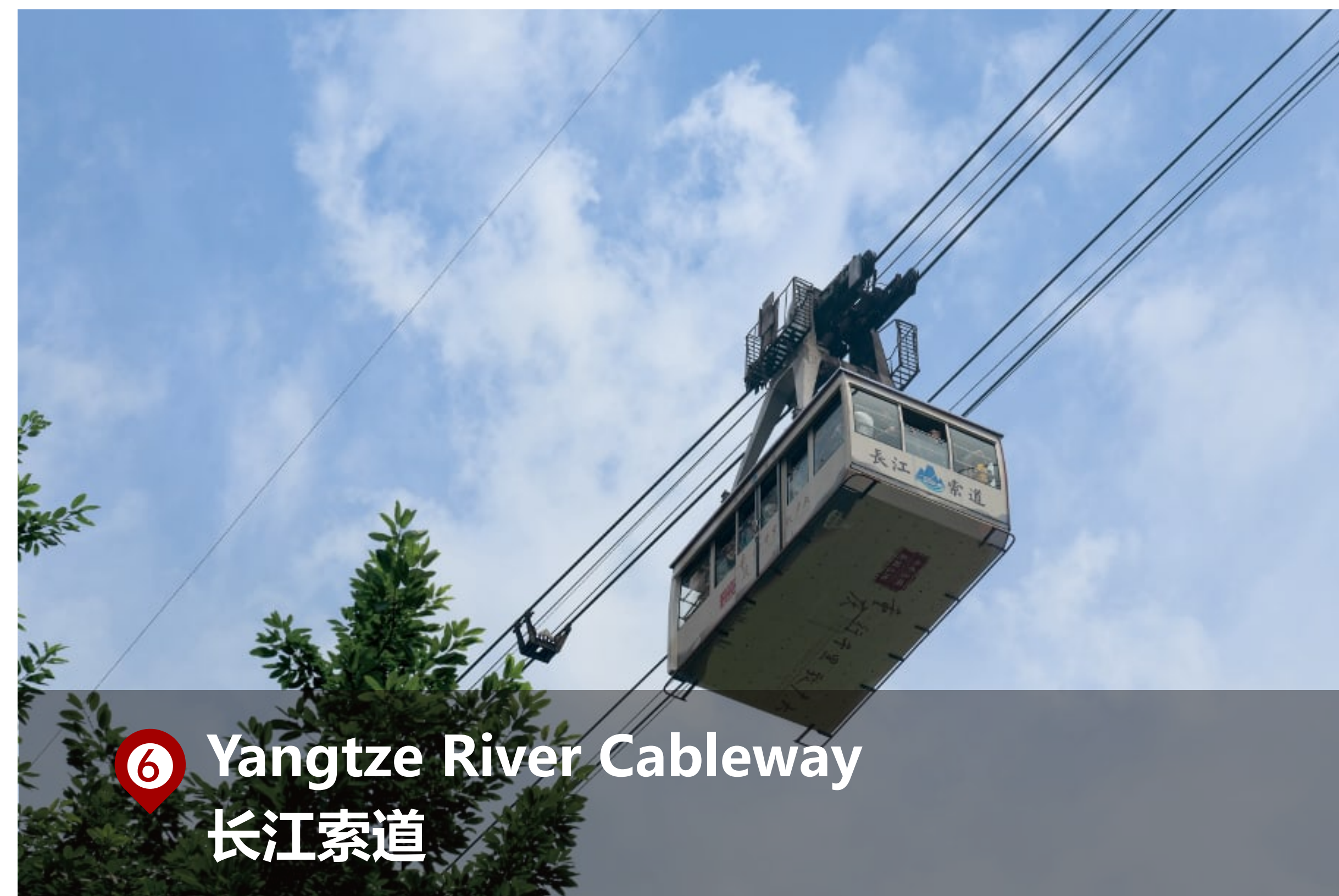
⑥ Yangtze River Cableway 长江索道