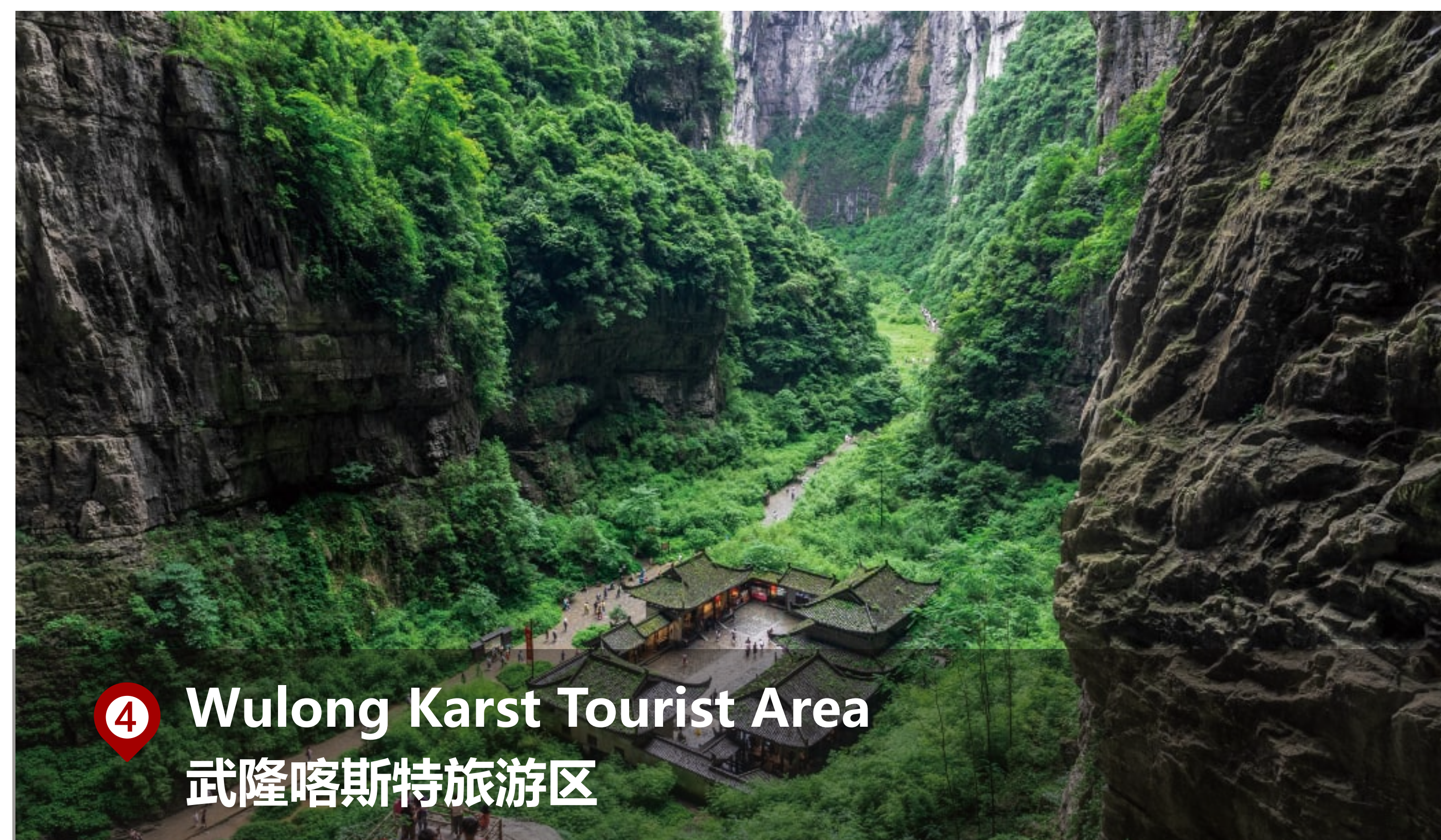
④ Wulong Karst Tourist Area 武隆喀斯特旅游区