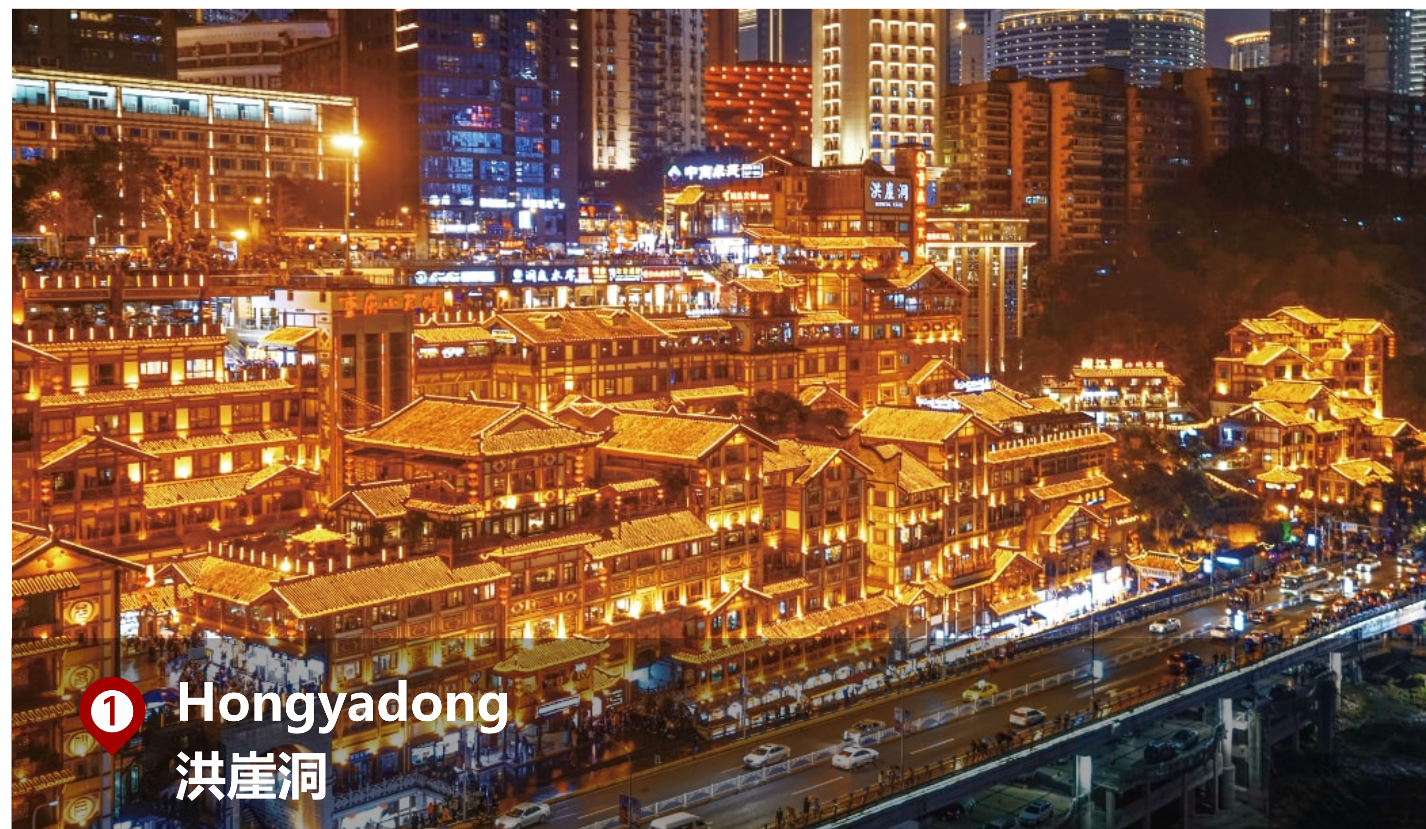
① Hongyadong 洪崖洞