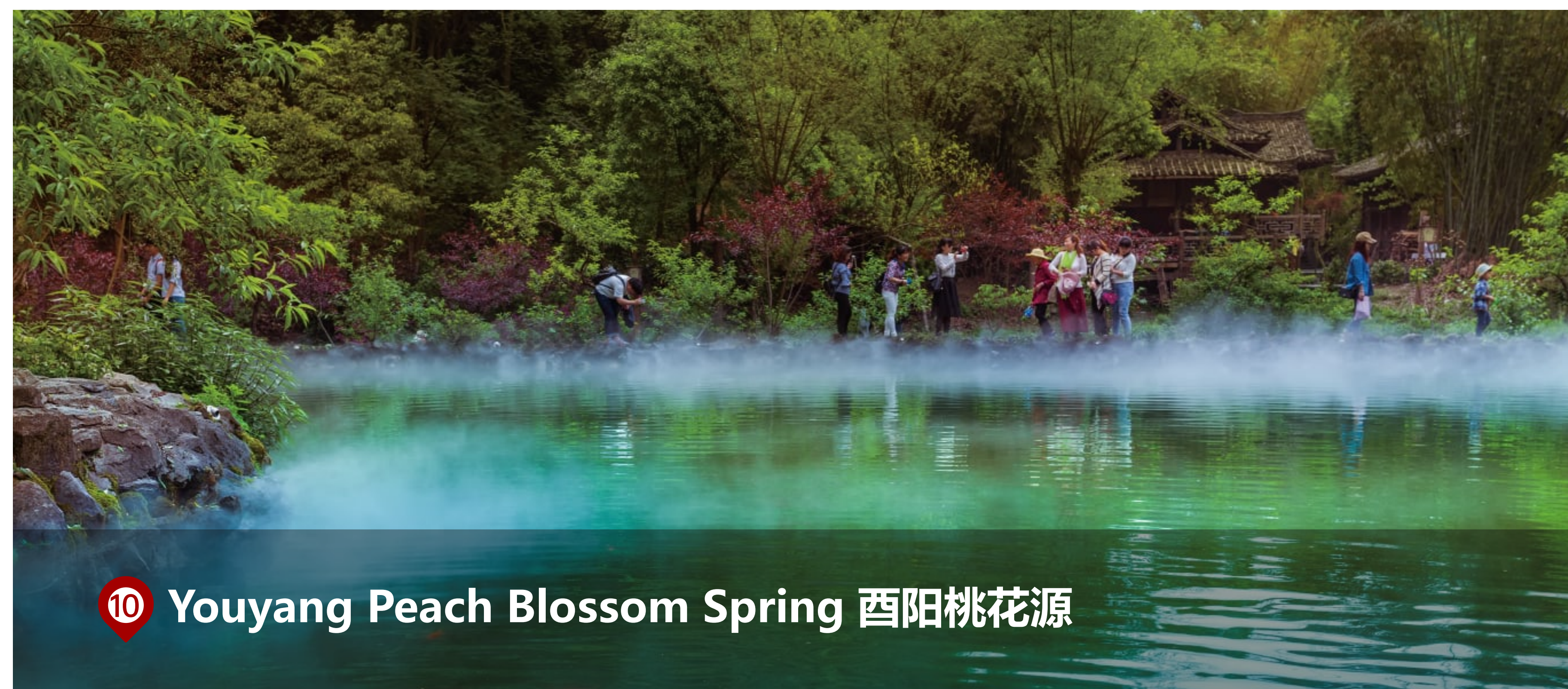
10 Youyang Peach Blossom Spring 酉阳桃花源