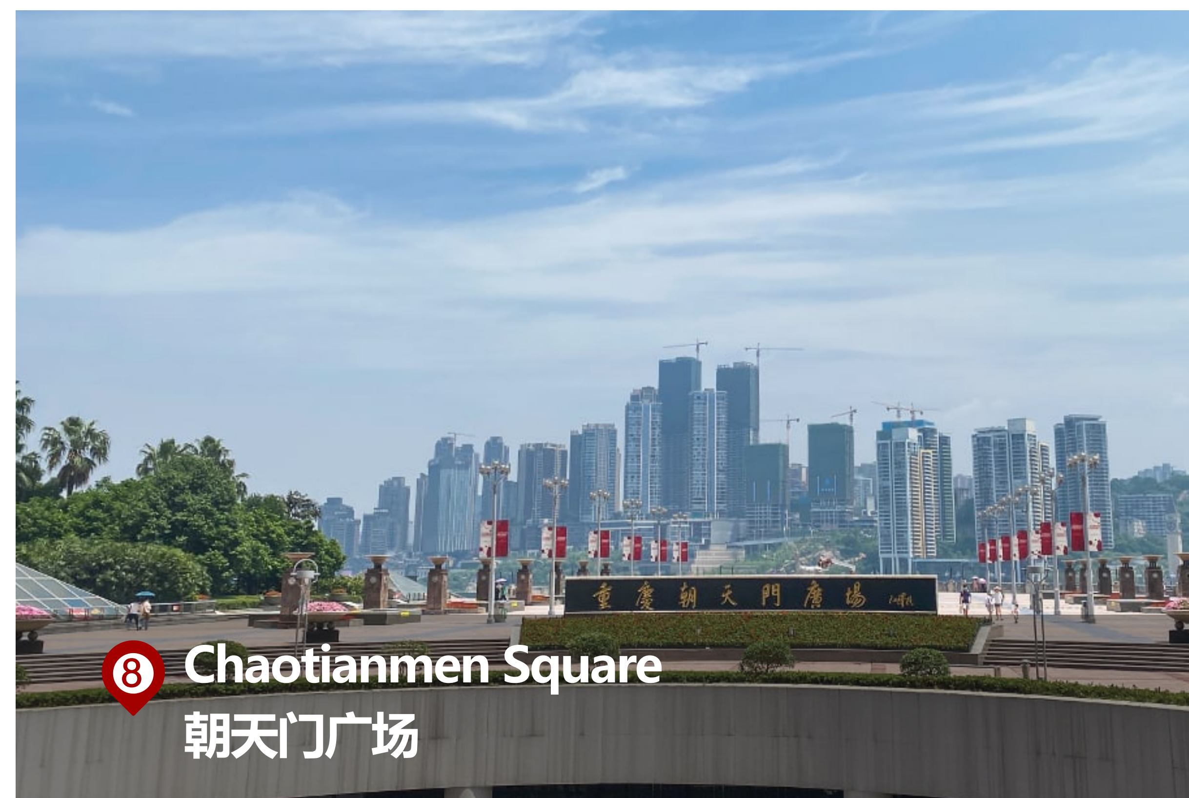
⑧ Chaotianmen Square 朝天门广场