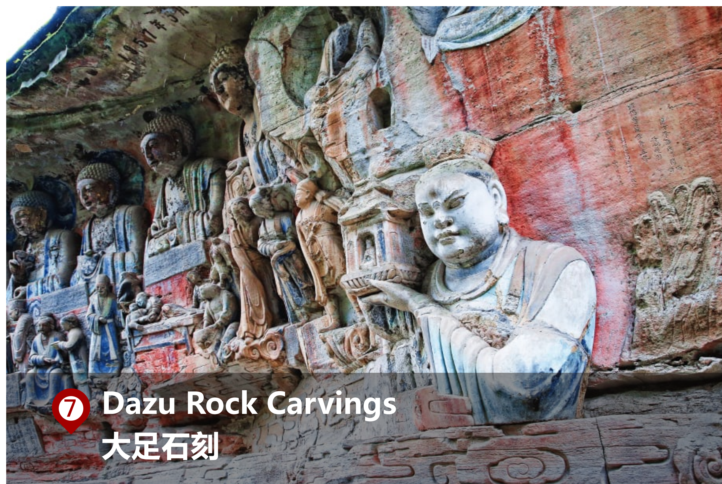
⑦ Dazu Rock Carvings 大足石刻