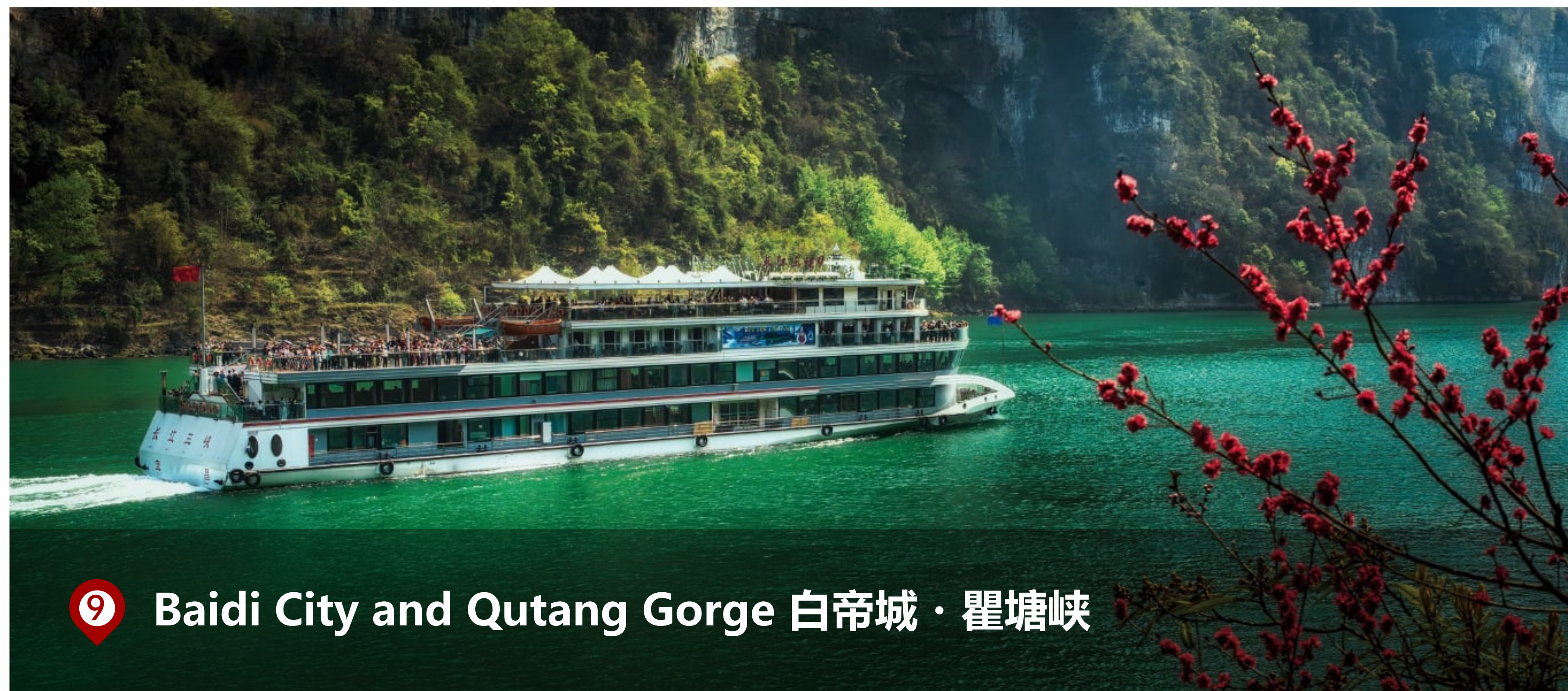
9 Baidi City and Qutang Gorge 白帝城 · 瞿塘峡