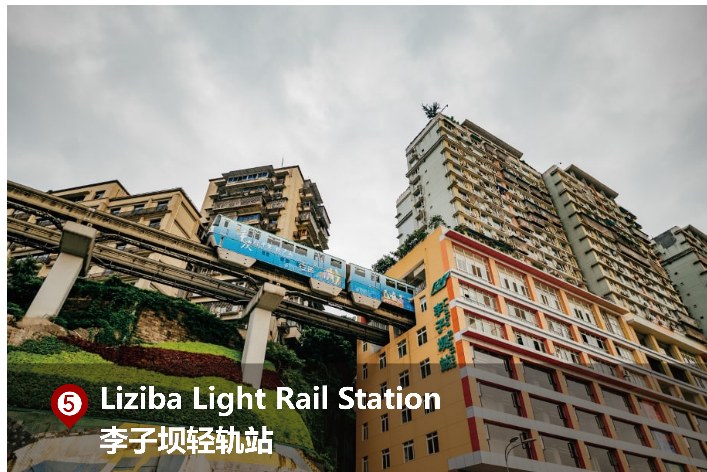
⑤ Liziba Light Rail Station 李子坝轻轨站